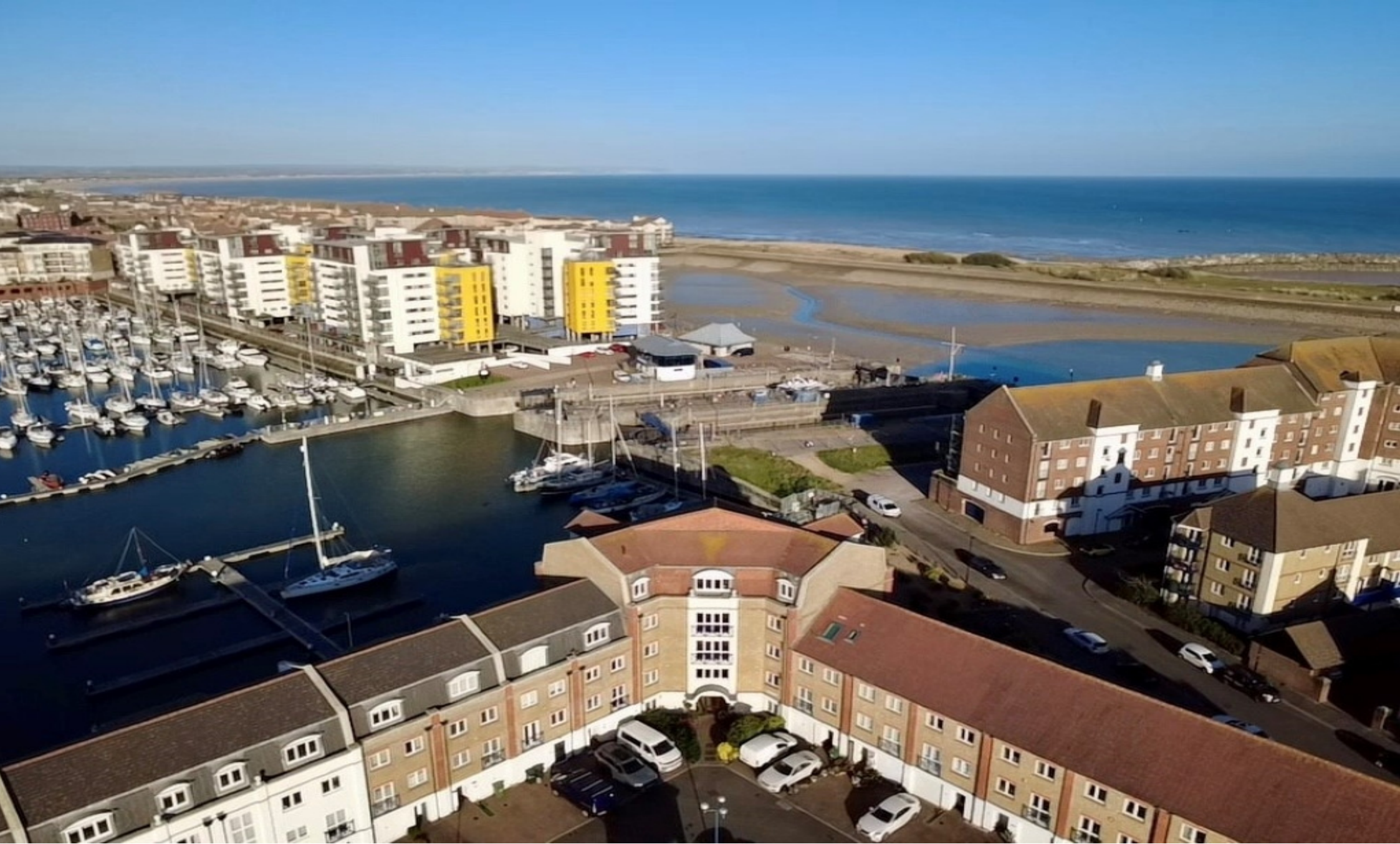
The Piazza, Eastbourne BN23 5TG