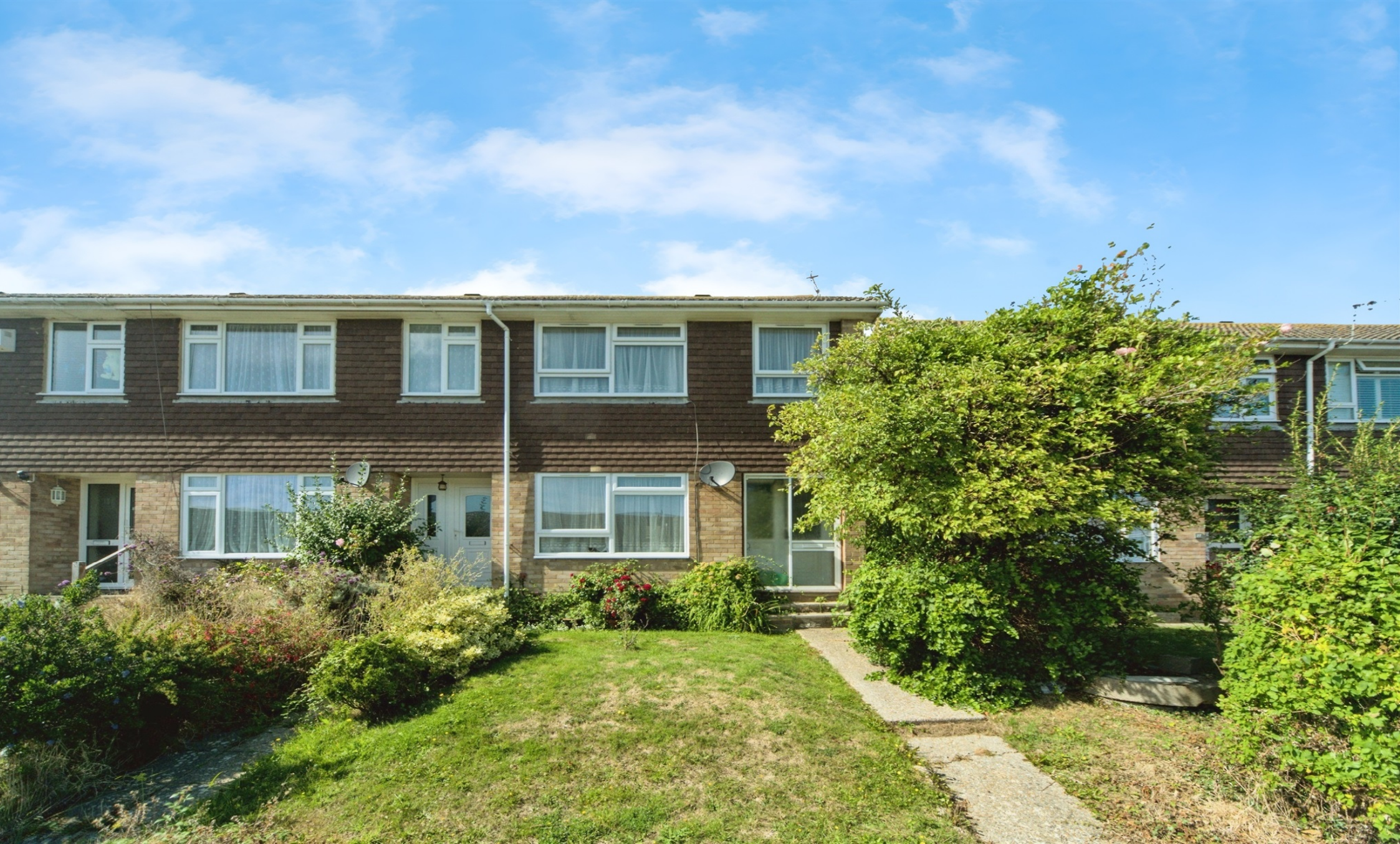
The Rising, Eastbourne BN23 7TL