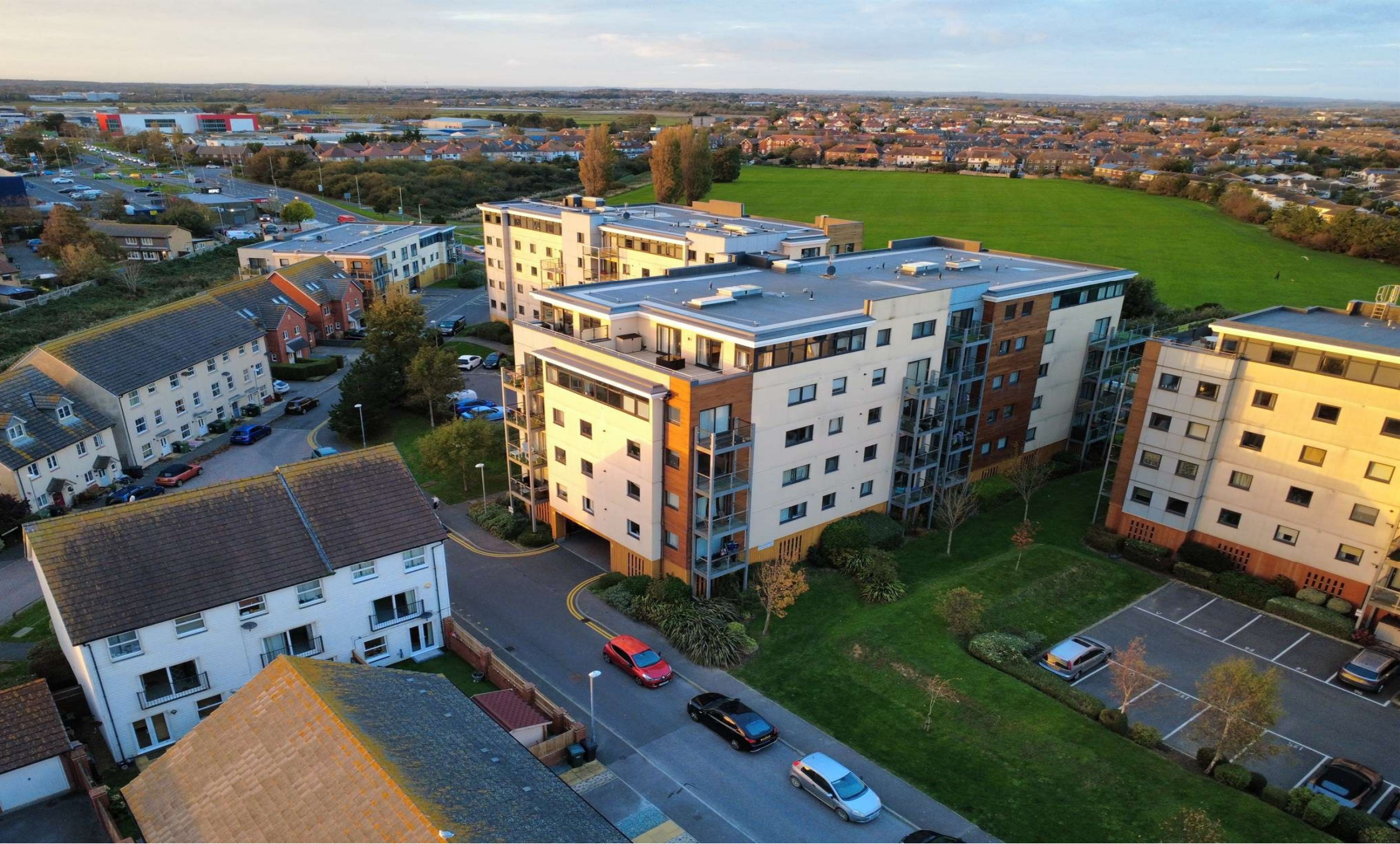
Penshurst House Groombridge Avenue, Eastbourne BN22 7FG