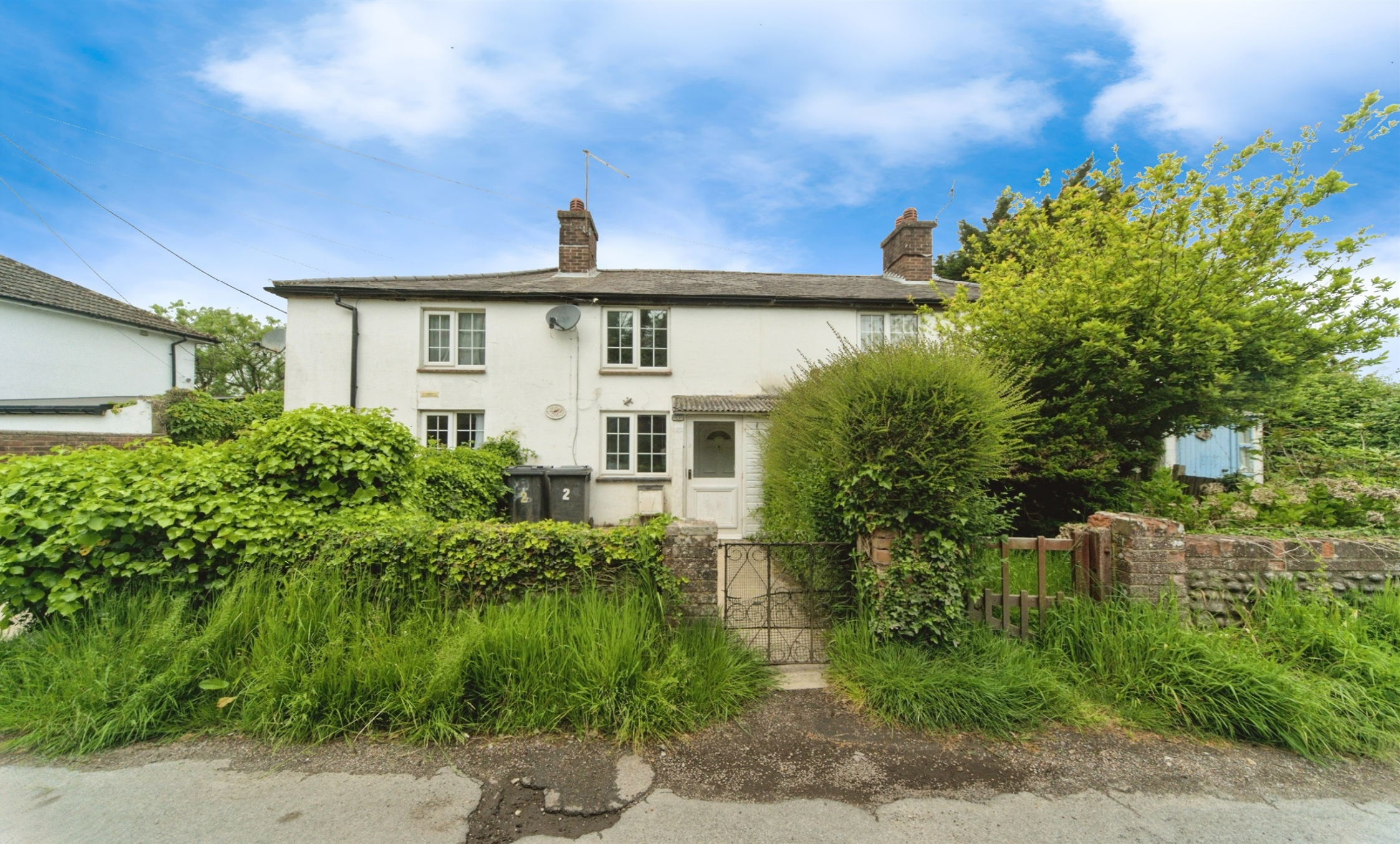
Victoria Cottages Milton Street, Hankham Pevensy BN24 5AX