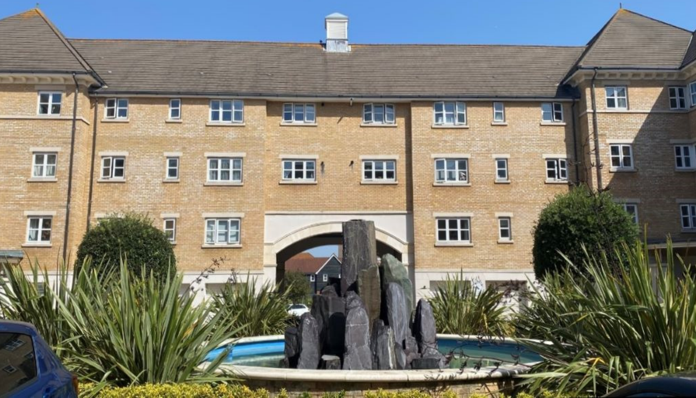
Trujillo Court Callao Quay, Eastbourne BN23 5AB