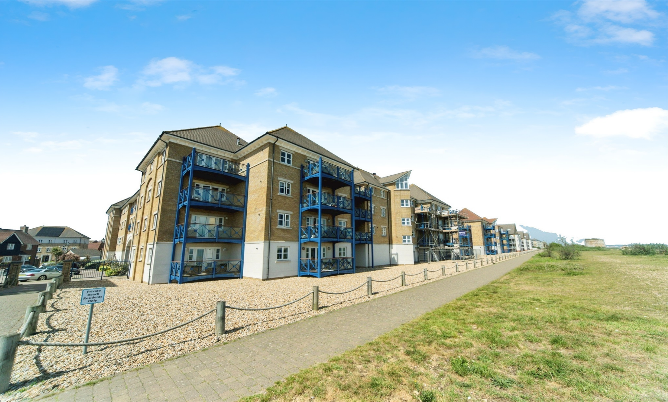
Trujillo Court Callao Quay, Eastbourne BN23 5AB