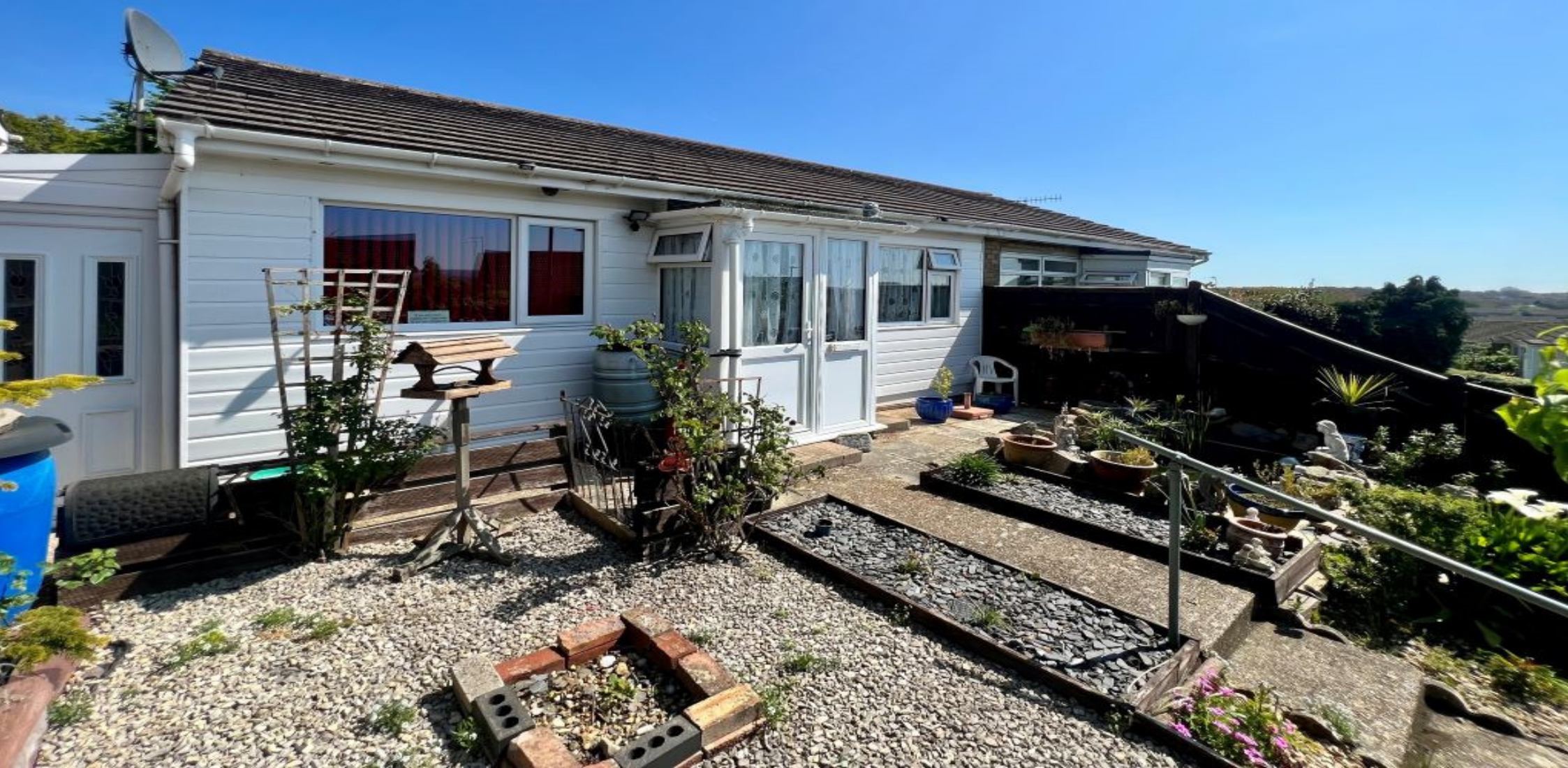
Jay Close, EASTBOURNE BN23 7RW