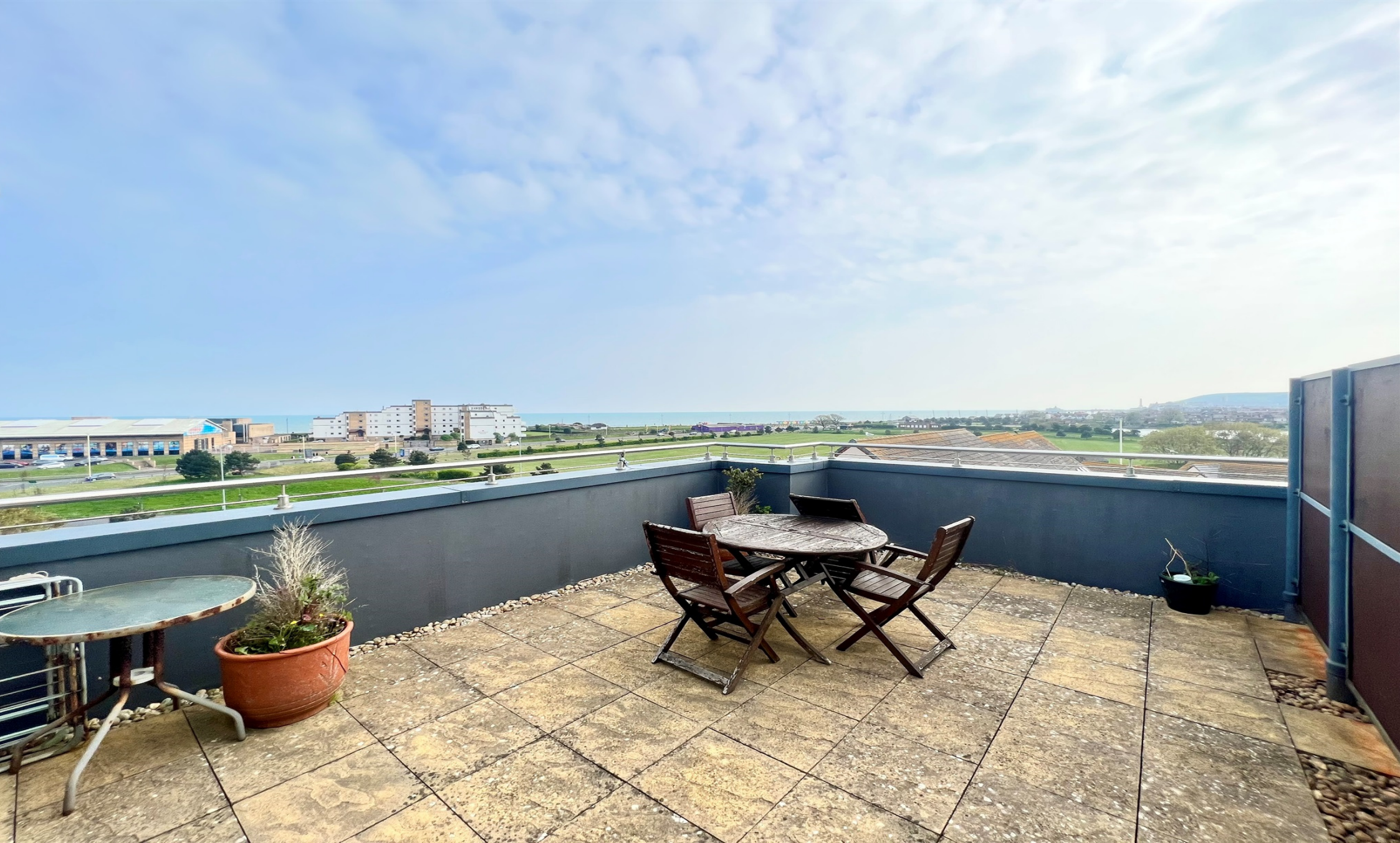
Scotney House Groombridge Avenue, Eastbourne BN22 7FE