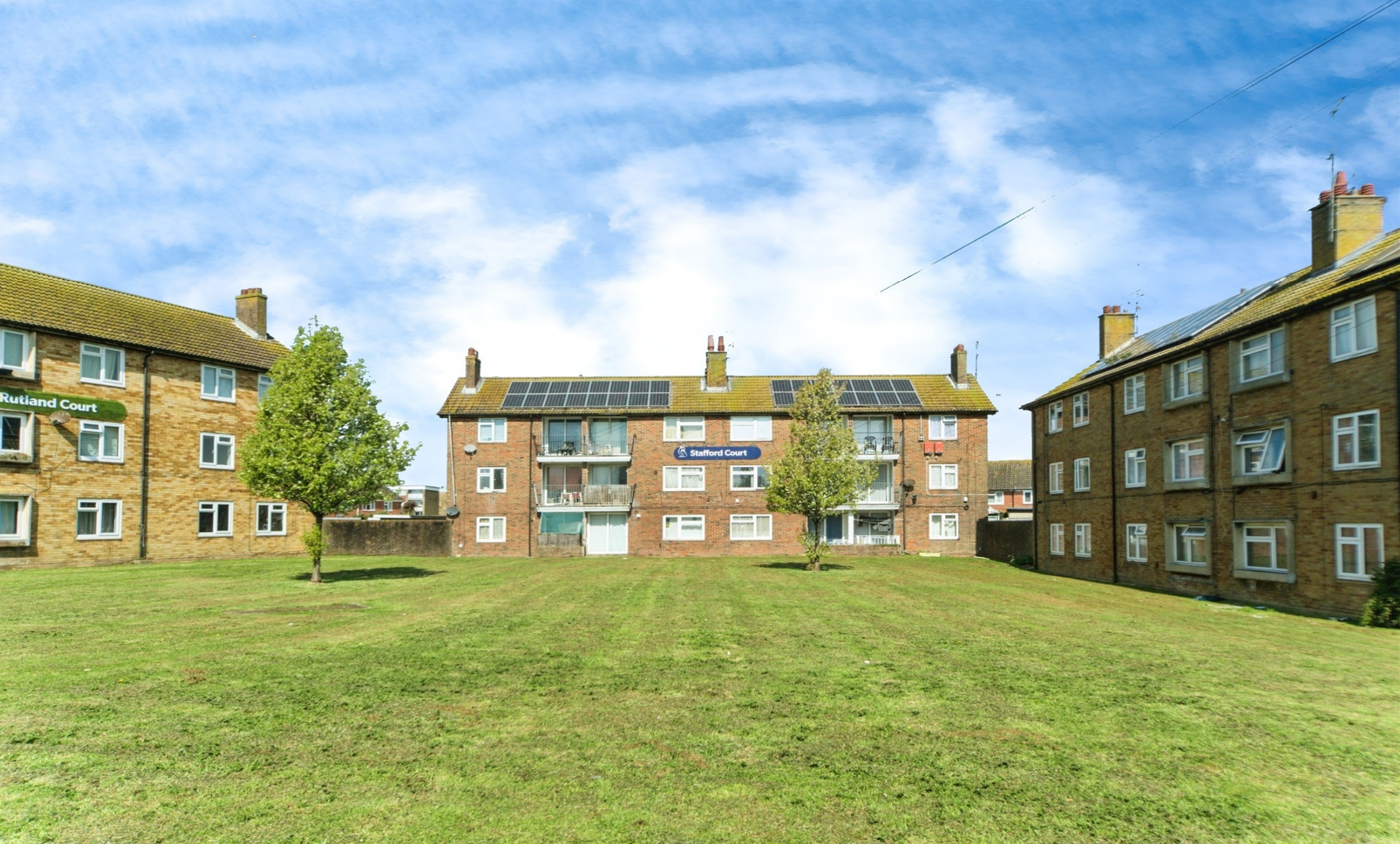
Stafford Court Etchingam Road,EASTBOURNE BN23 7DF