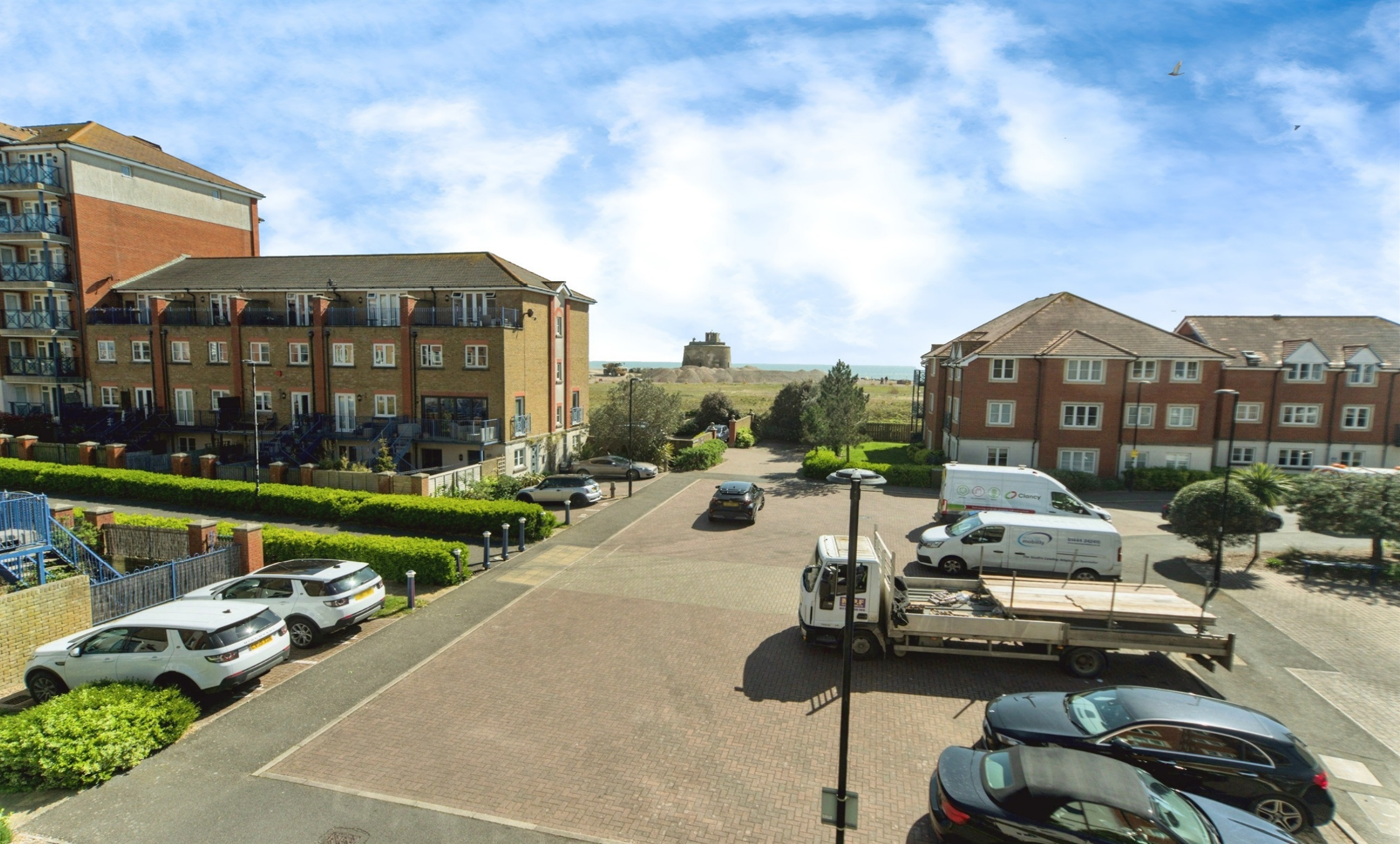
Dominica Court, Eastbourne BN23 5TR