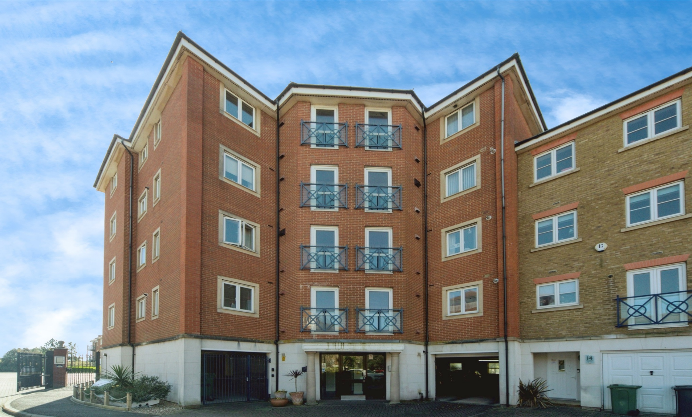
Dominica Court, Eastbourne BN23 5TR