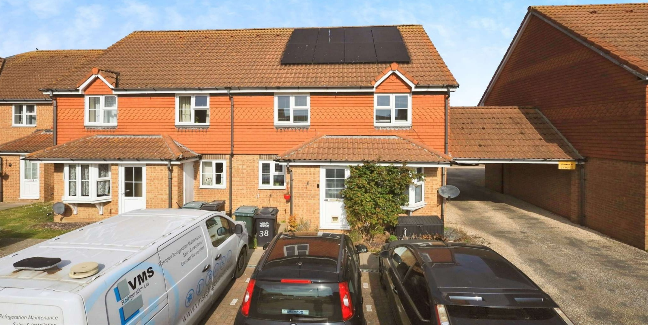
The Portlands, Eastbourne BN23 5RD