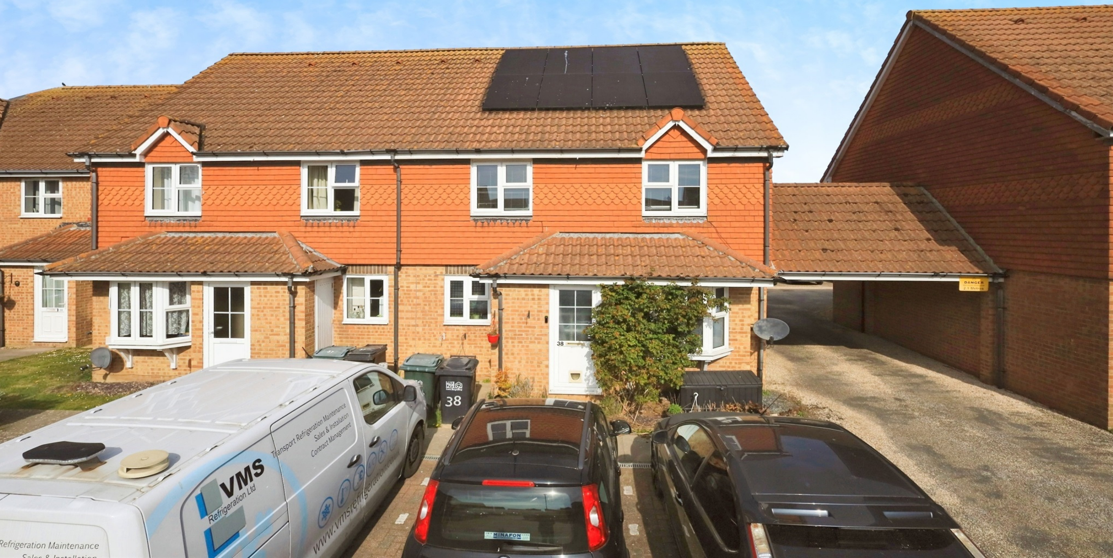
The Portlands, Eastbourne BN23 5RD