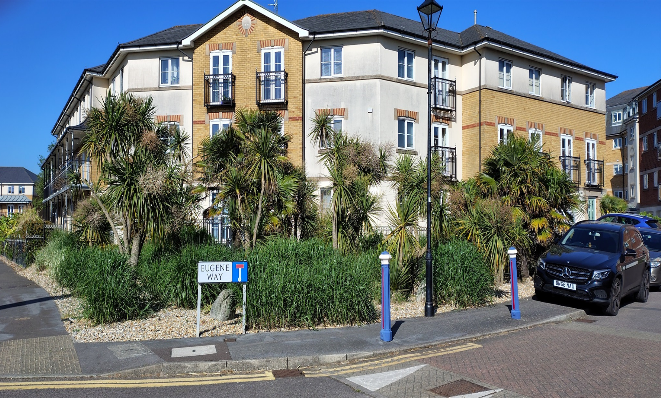
Eugene Way, Eastbourne BN23 5BH