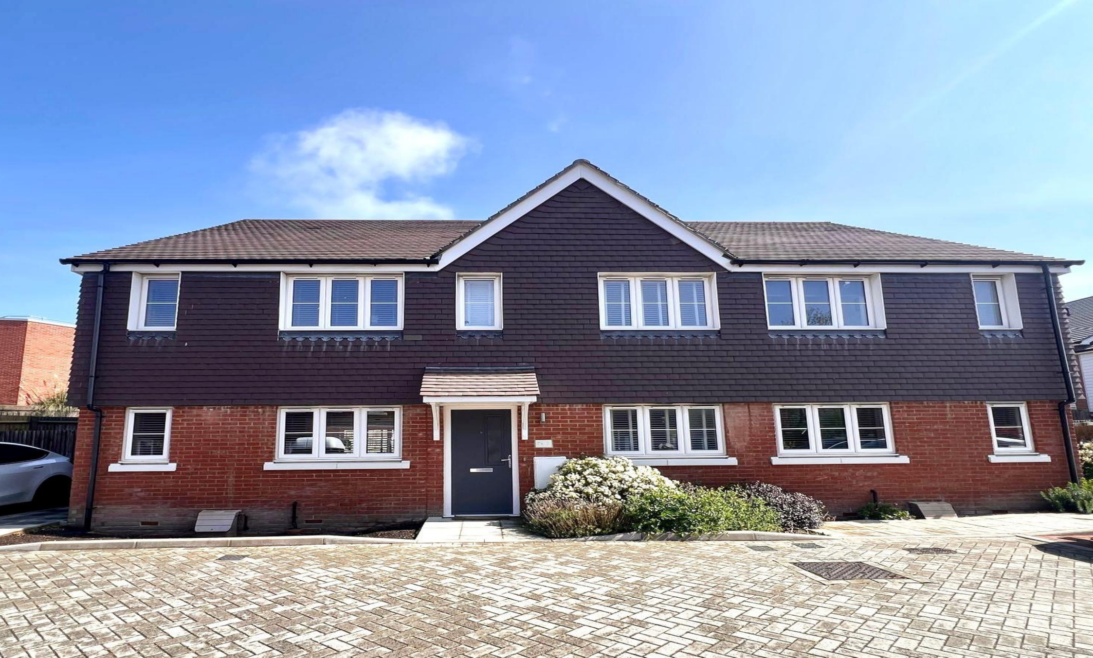
Avebury Mews, Eastbourne BN23 7FA