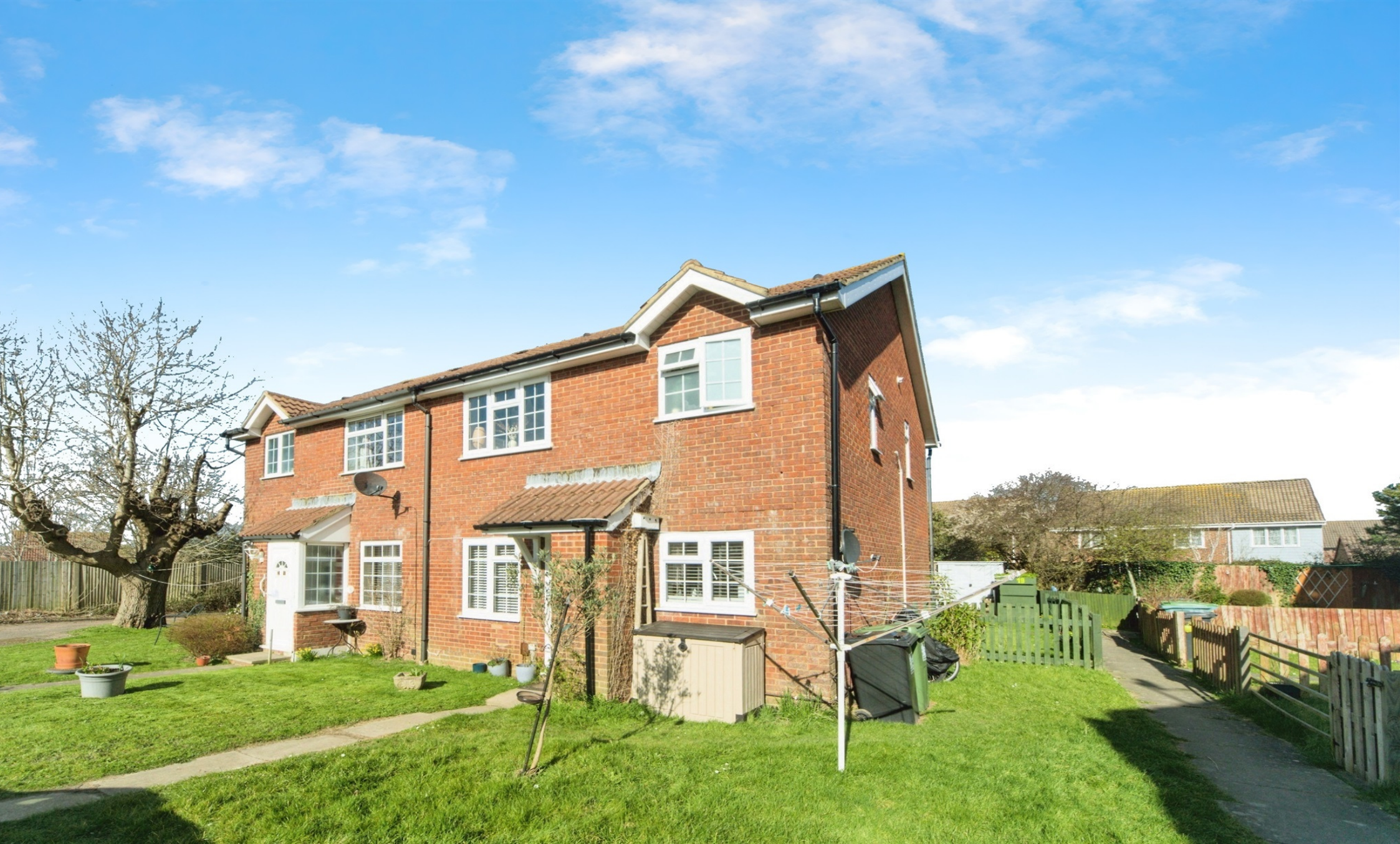
Snowdon Close, Eastbourne BN23 8HW