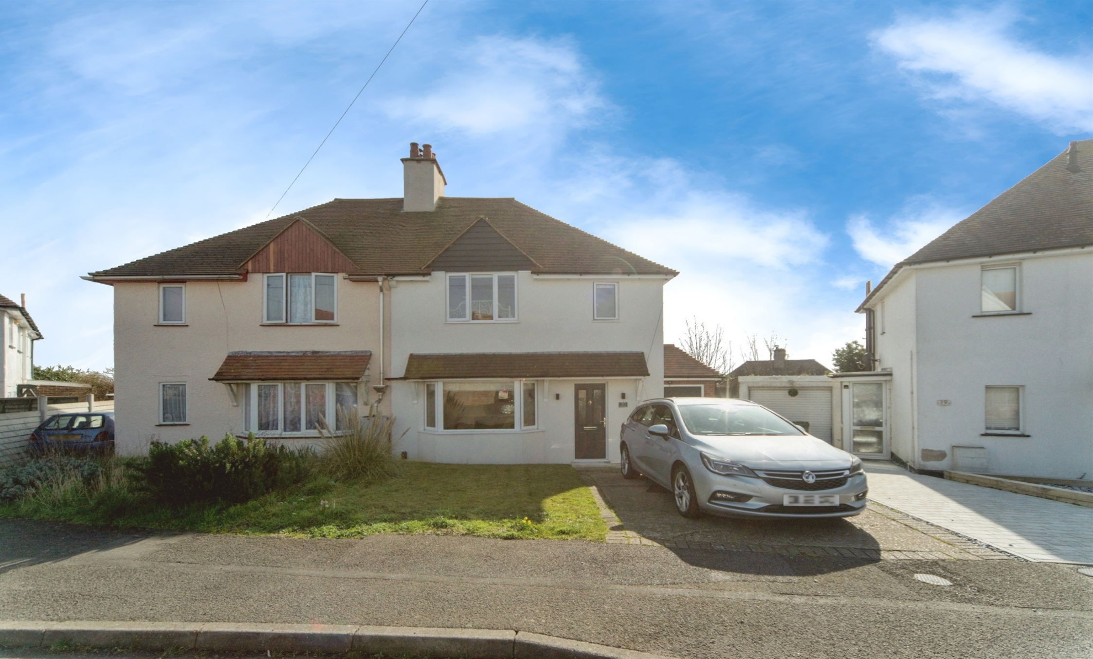
The Circus, Eastbourne BN23 6LL