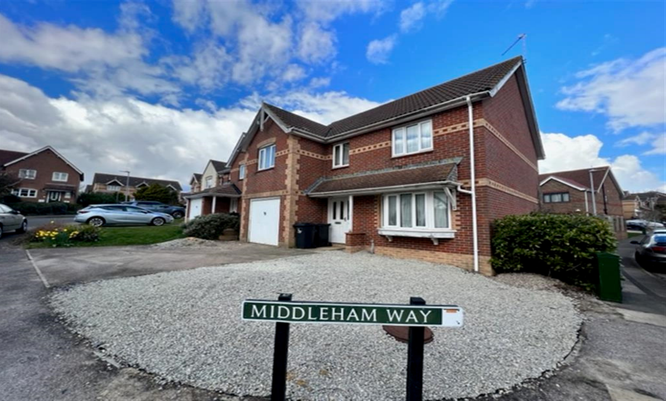
Middleham Way, Eastbourne BN23 8NT