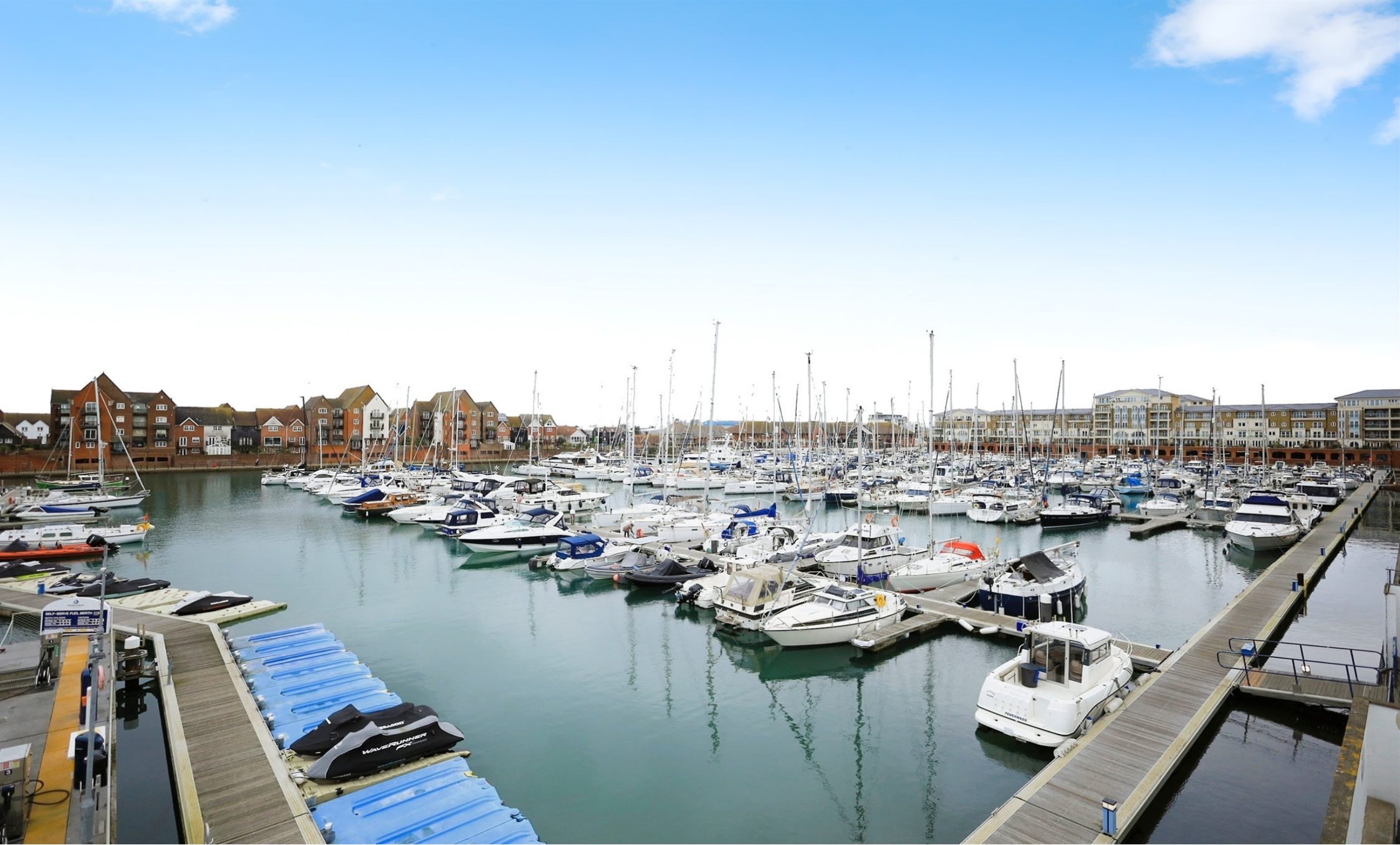
Orvis Court Midway Quay, Eastbourne BN23 5DF