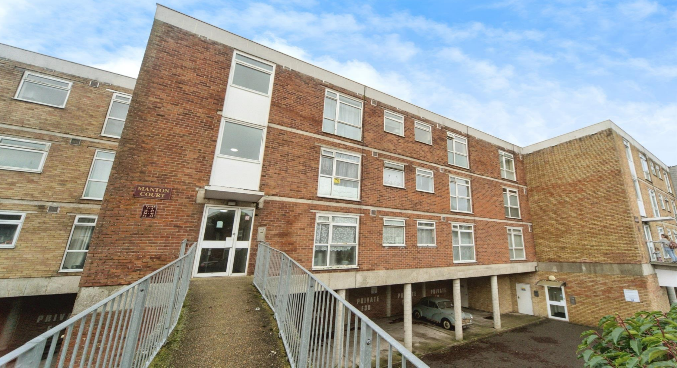
Manton Court, Rotunda Road, Eastbourne BN23 6LG