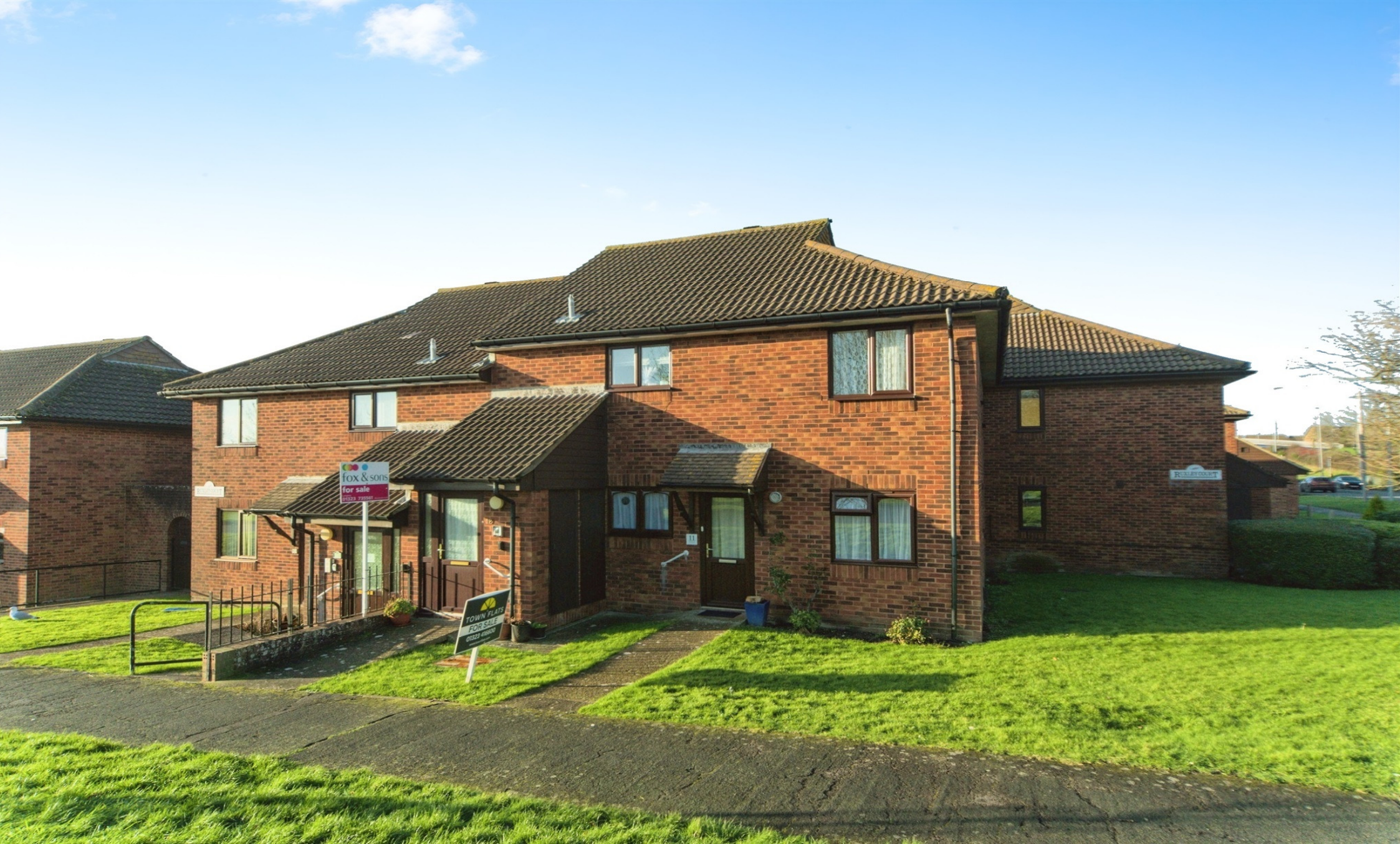
Ruxley Court Langney Rise, Eastbourne BN23 7HE