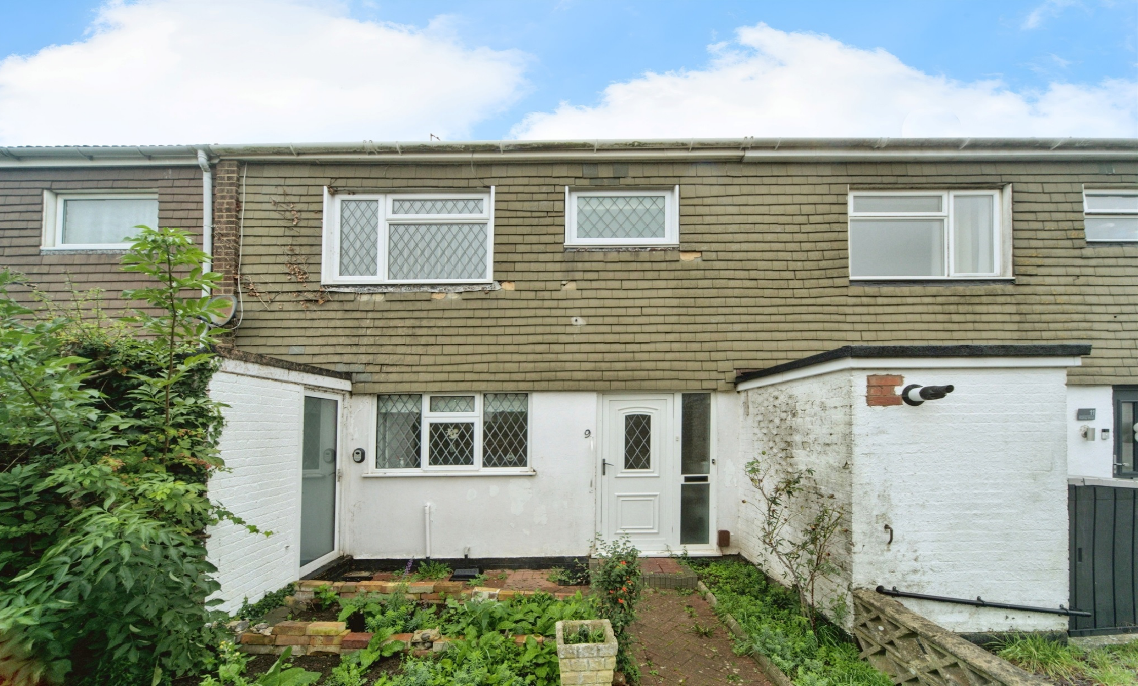
Rodney Close, Eastbourne BN23 6AR