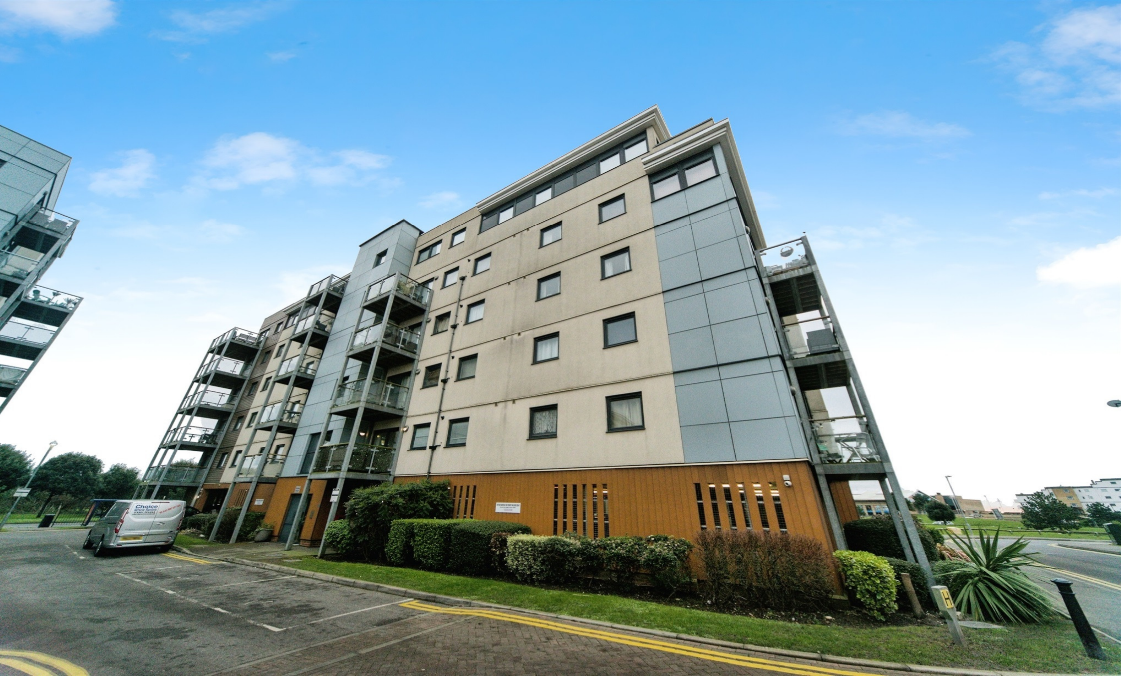
Scotney House Groombridge Avenue, Eastbourne BN22 7FE