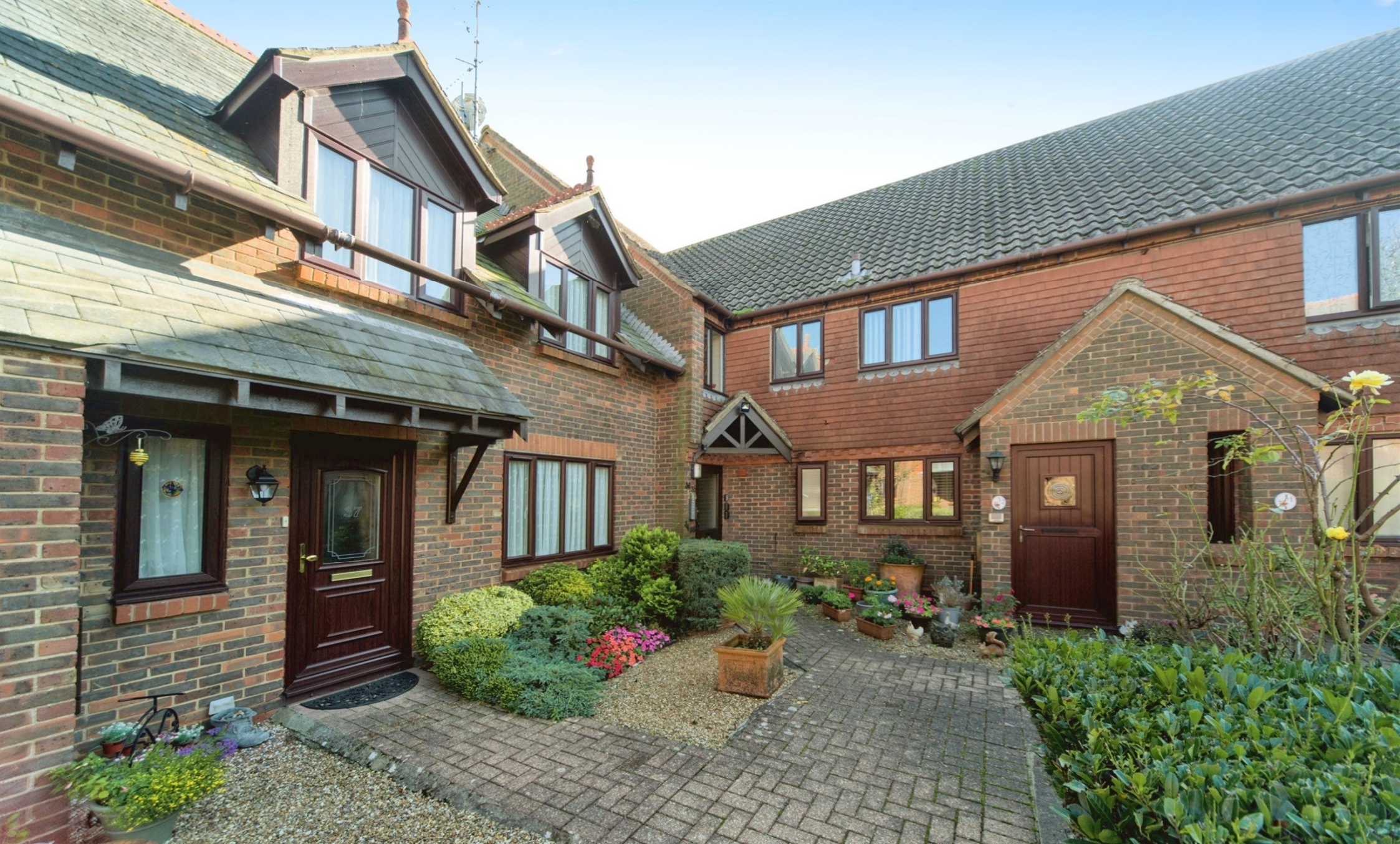
Church Bailey, Westham Pevensy BN24 5NQ