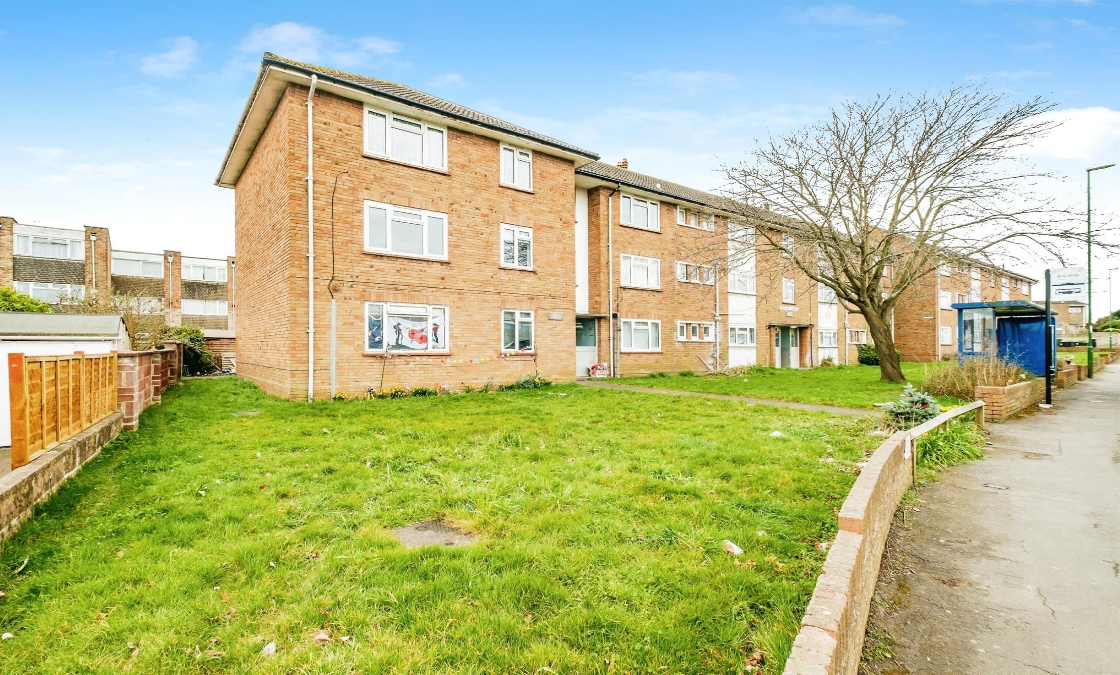
Orchard House Crabtree Lane,Lancing BN15 9PE