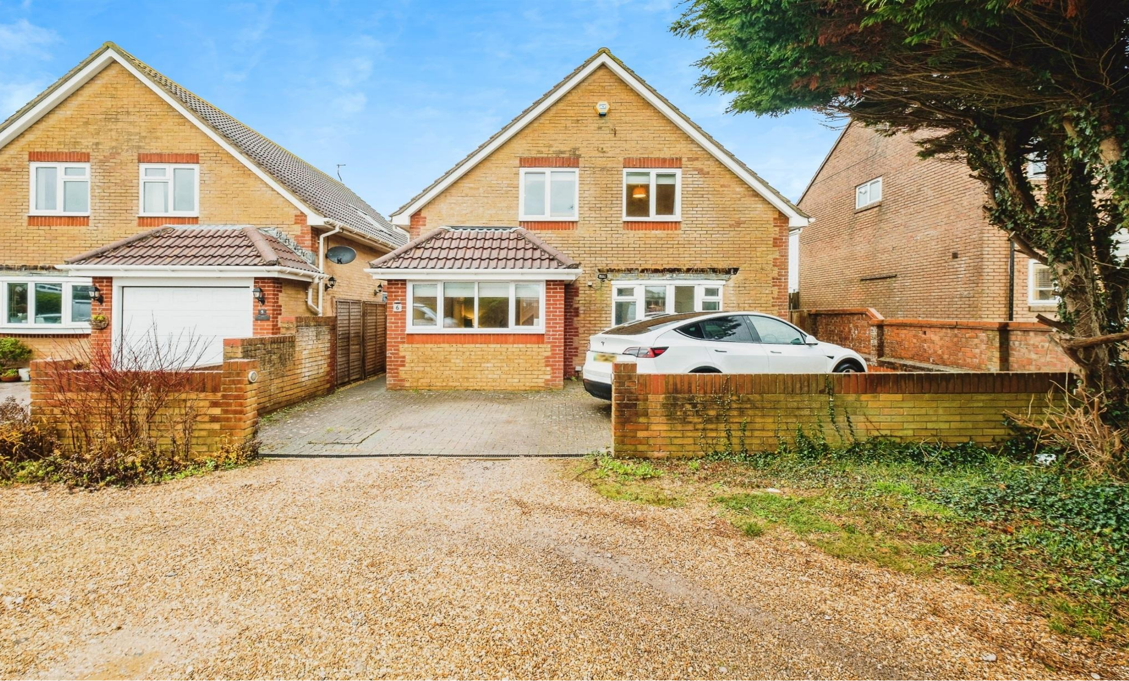
Swallows Close, Lancing BN15 8LS