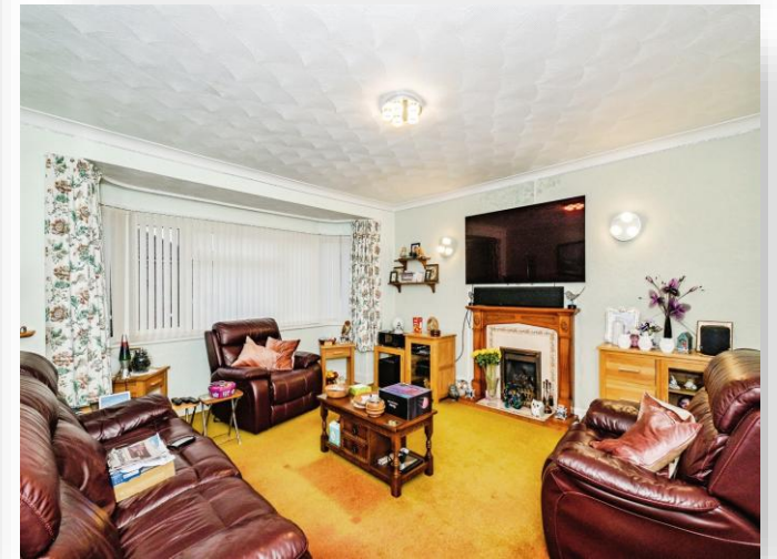
The Crescent, Lancing BN15 8PH