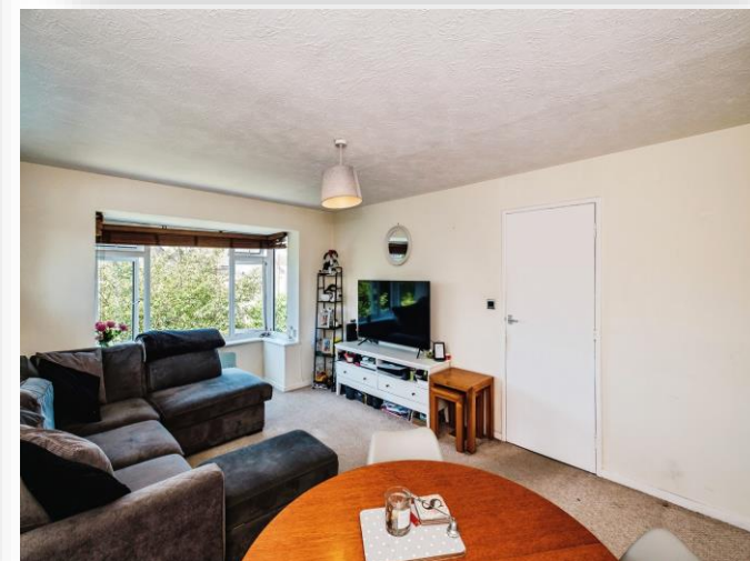
Rowan Court Annweir Avenue, Lancing BN15 9NE