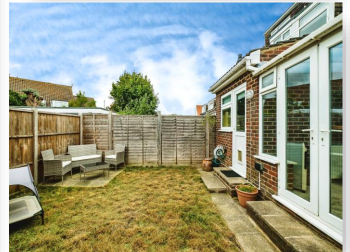
Loose Lane, Sompting Lancing BN15 0BG