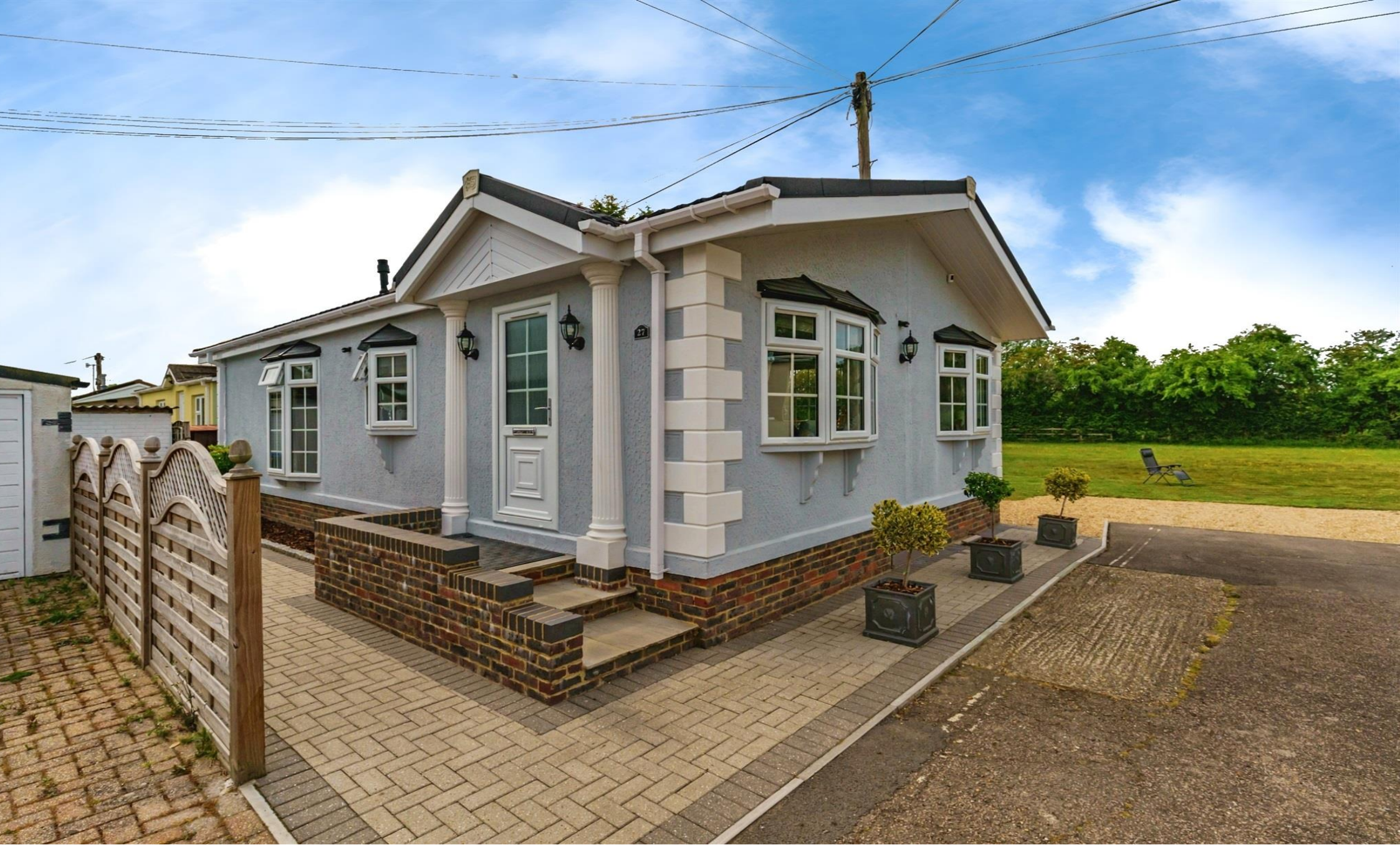
Laburnum Court, Smallfield Horley RH6 9QB