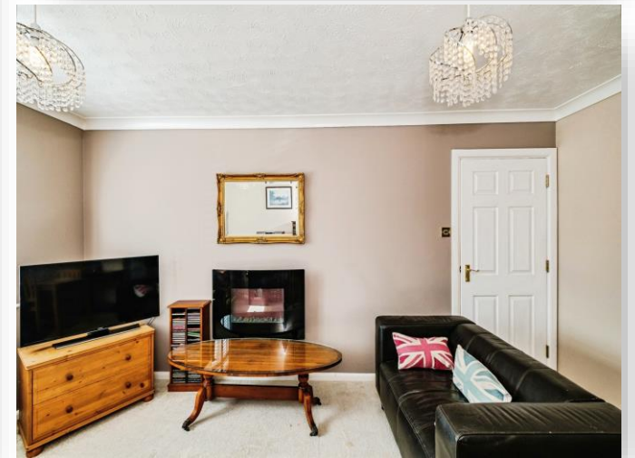
Amberley Court Freshbrook Road,Lancing BN15 8DS