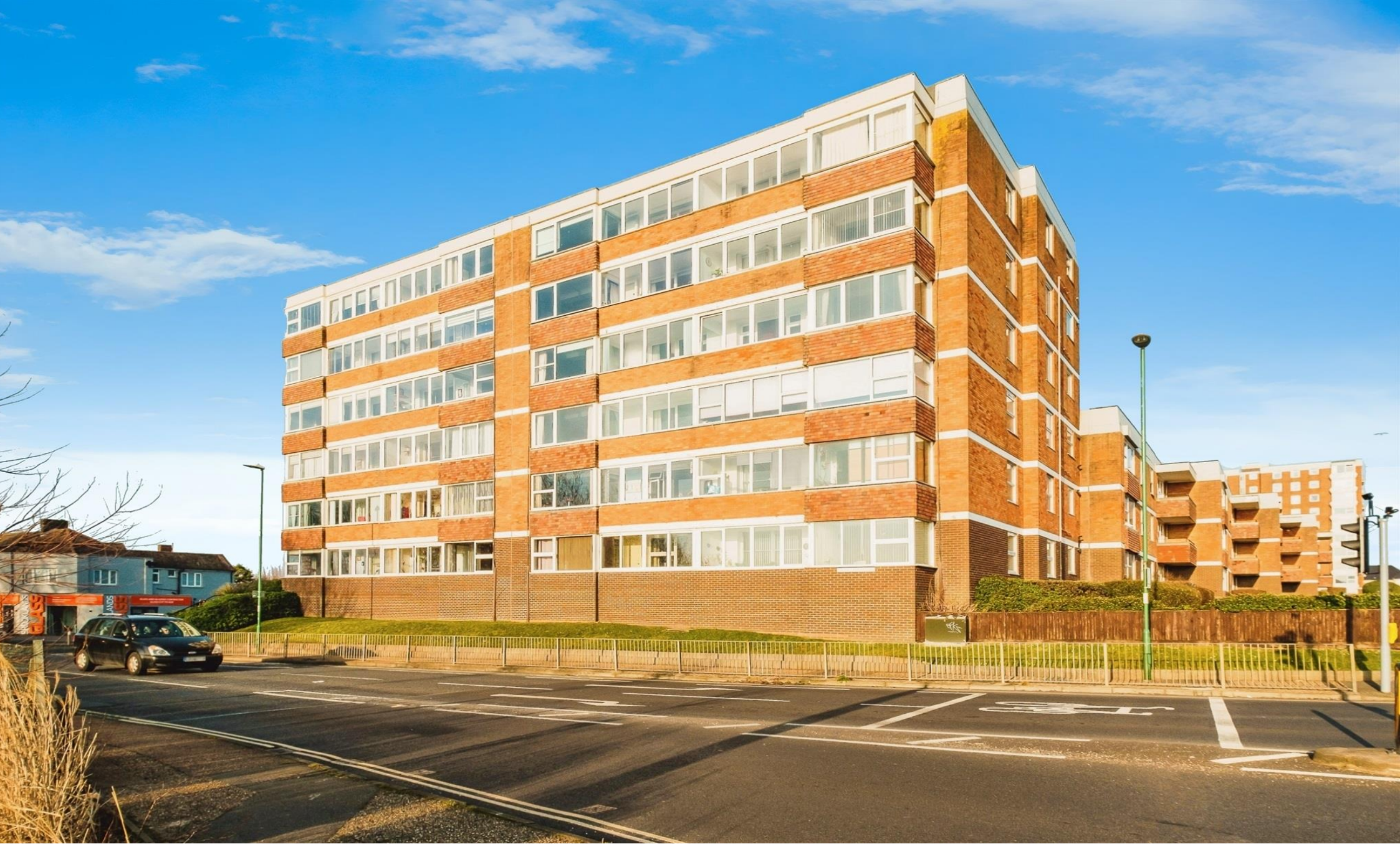
Francome House Brighton Road,Lancing BN15 8RP