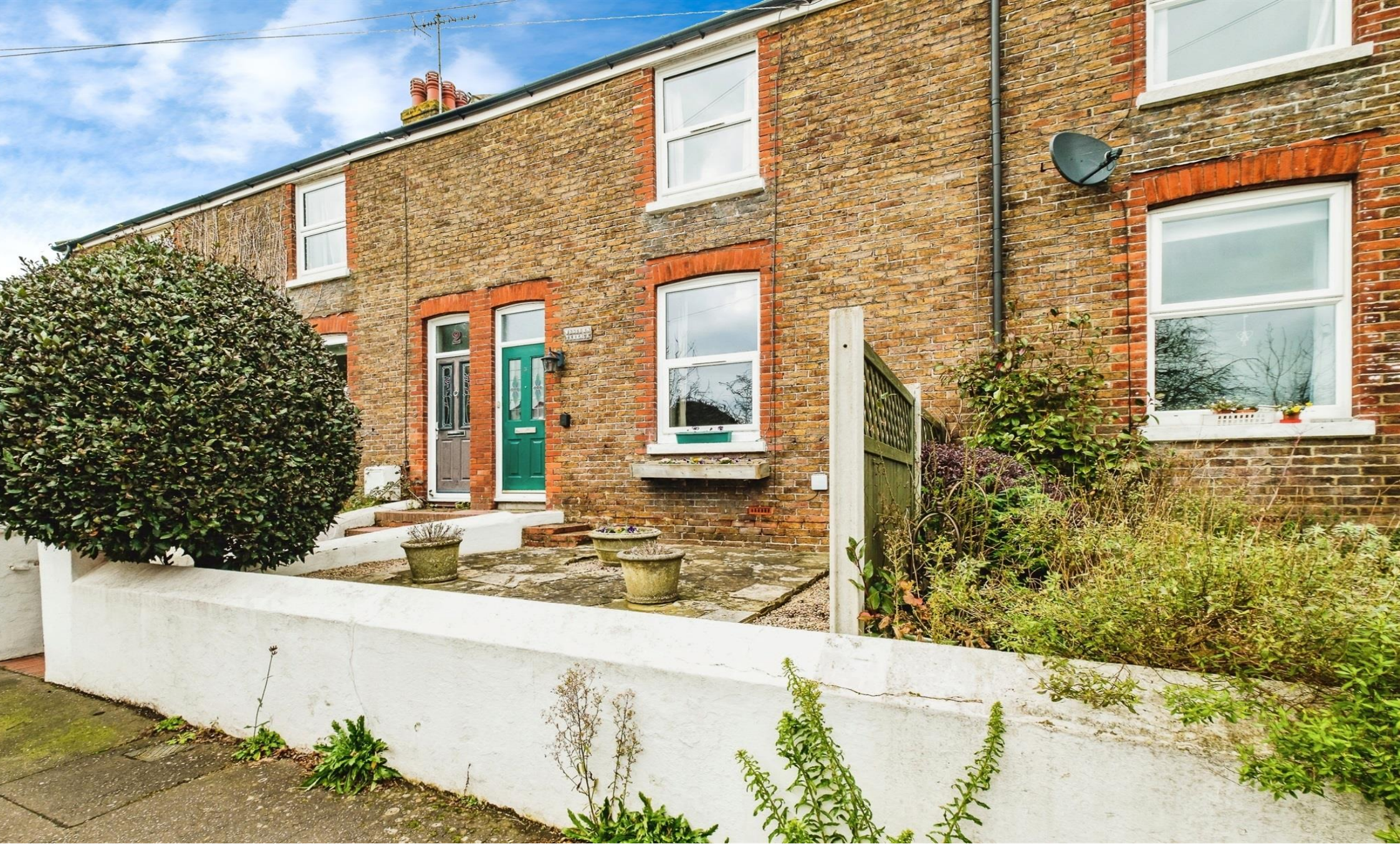
Western Terrace West Street, Sompting Lancing BN15 0AU