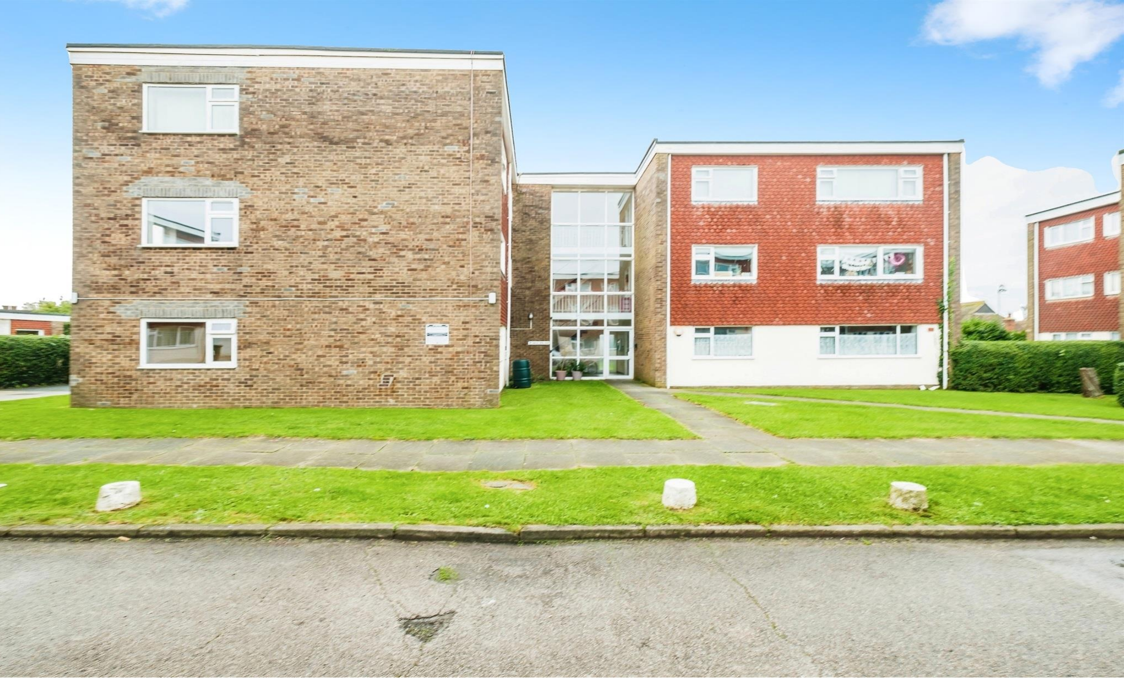
St Bernards Court Sompting Road,Lancing BN15 9HH