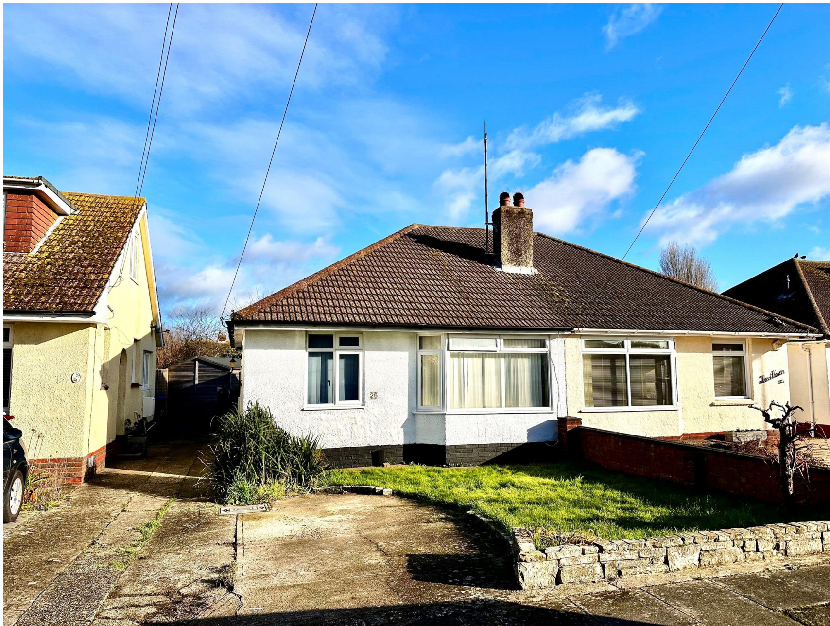
Links Road, LANCING BN15 9BY