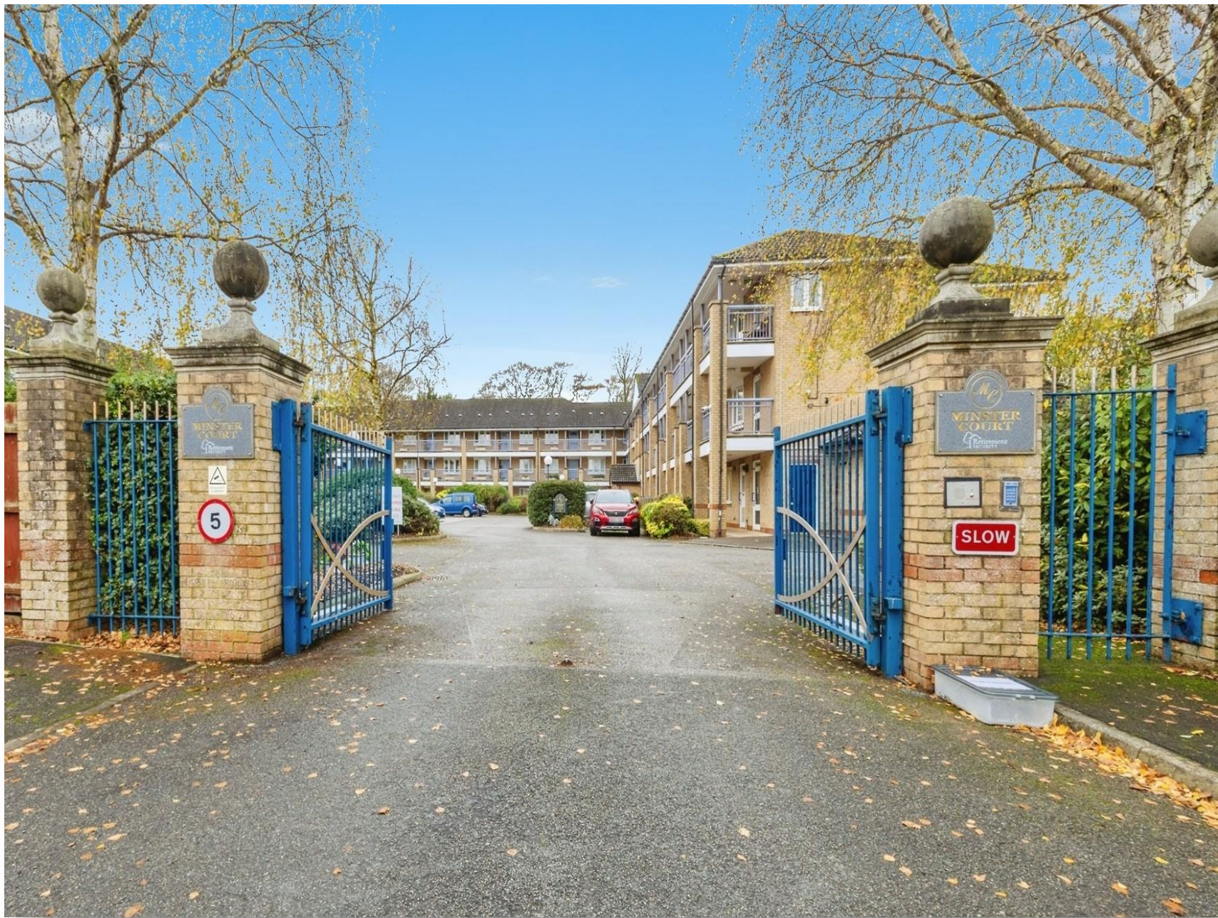
Minster Court, Bracebridge Heath Lincoln LN4 2TS