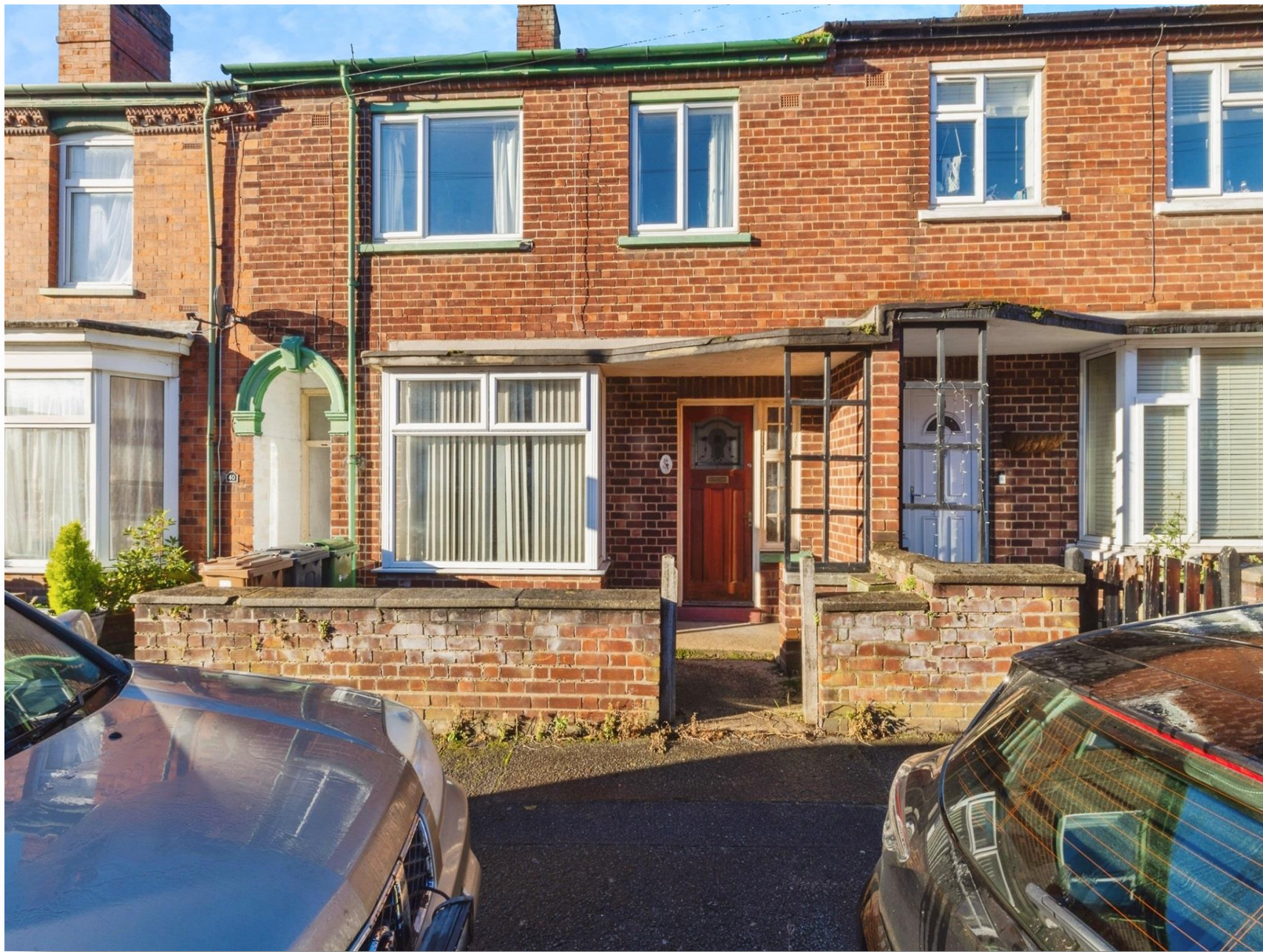
Avondale Street, Lincoln LN2 5BL