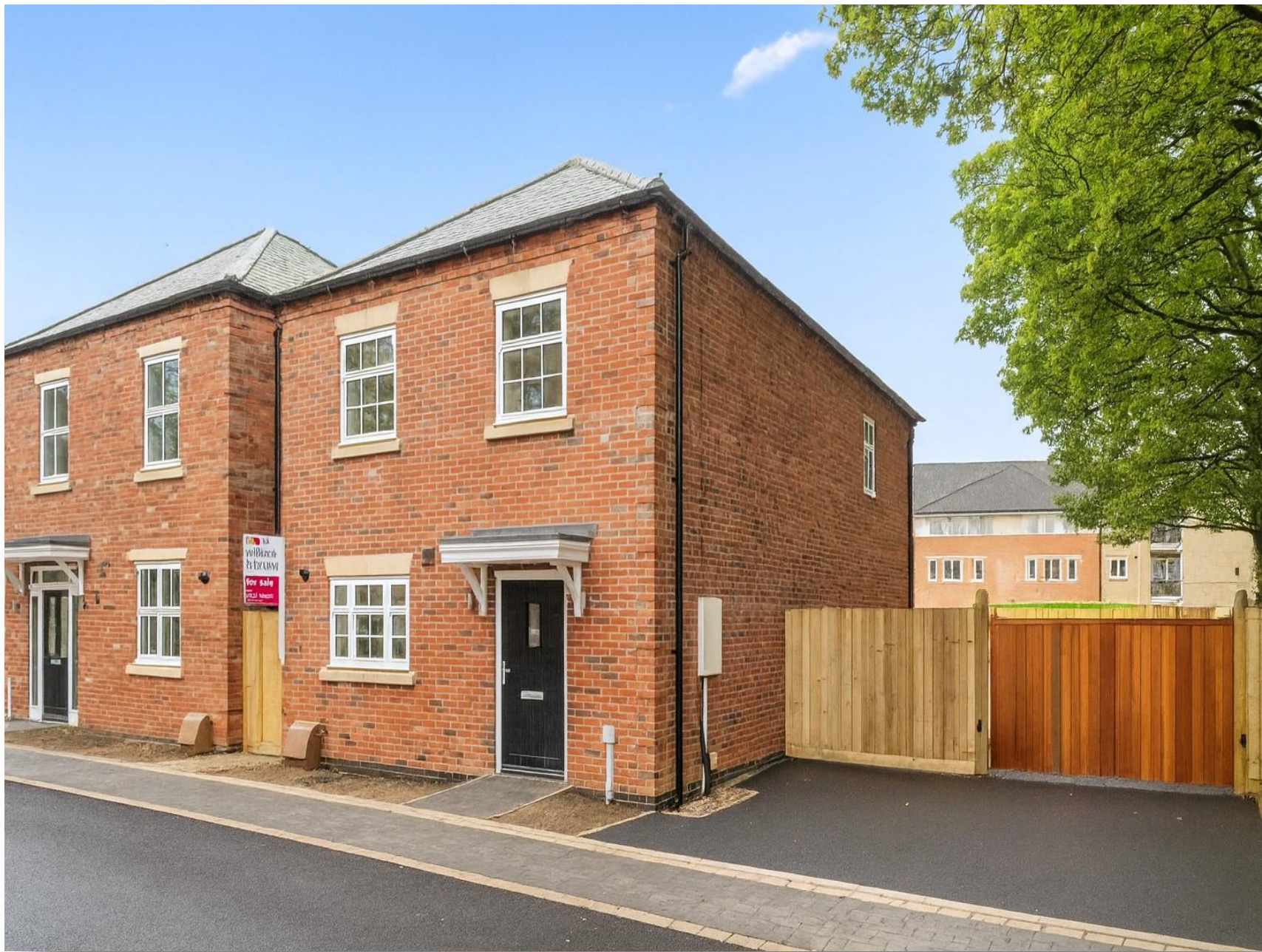
Plot 29 Medland Drive, Bracebridge Heath, Lincoln, LN4 2FS