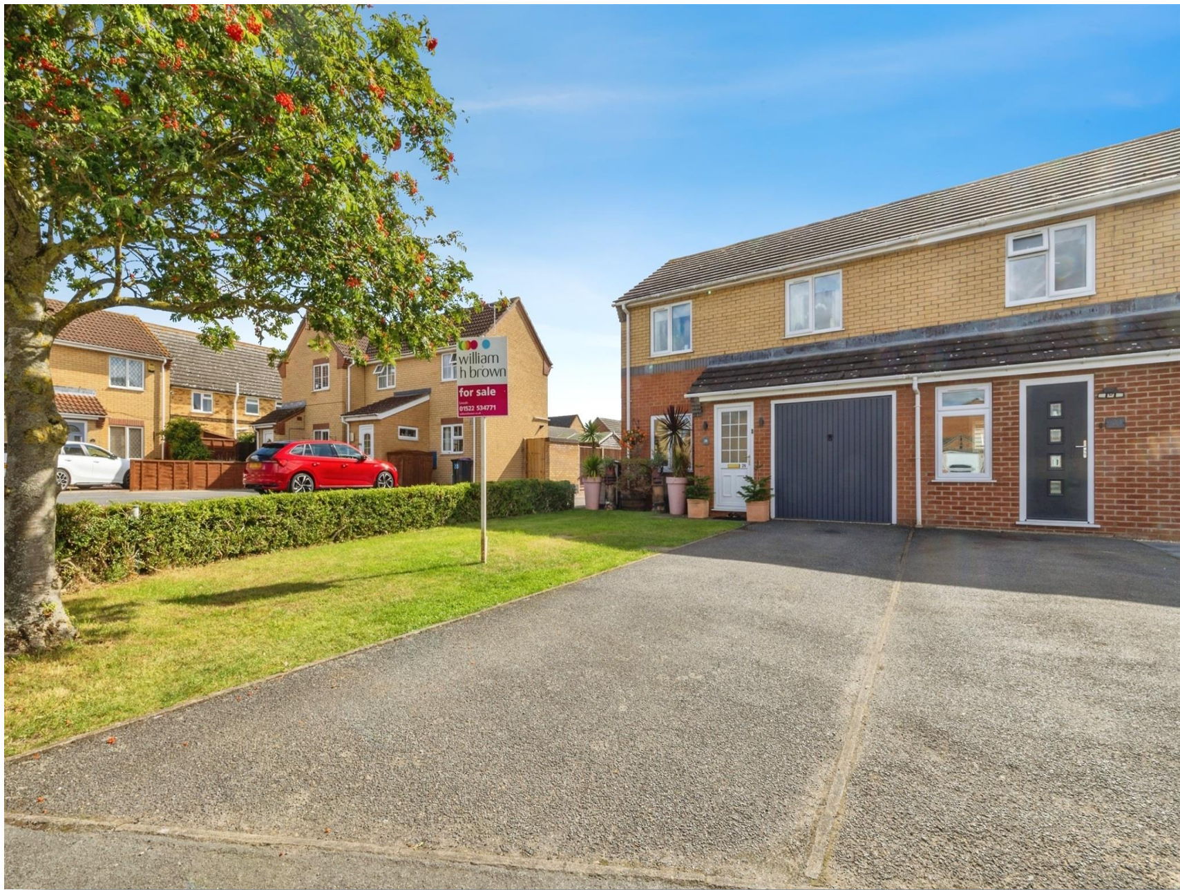
Shiregate, Metherringham Lincoln LN4 3DR