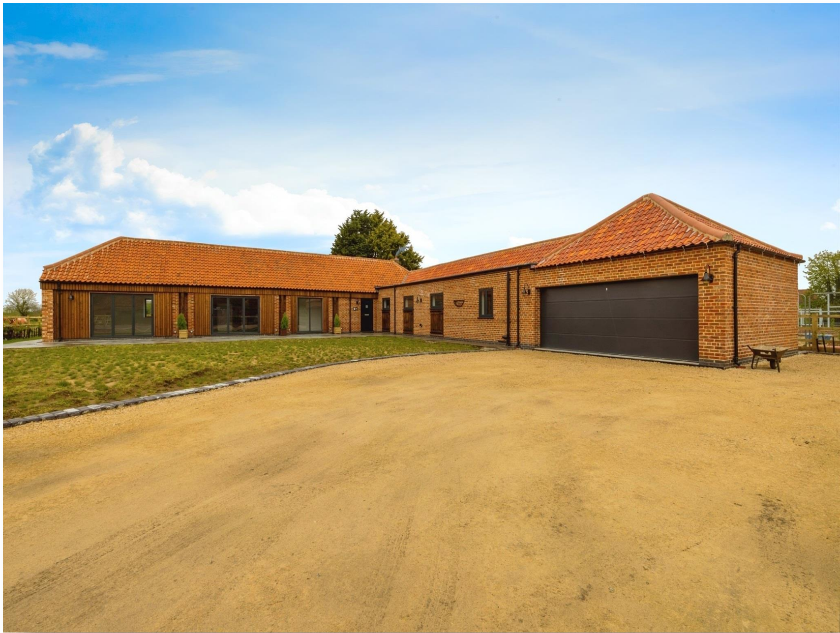
Manor Farm Yard Main Street, Timberland Lincoln LN4 3RZ