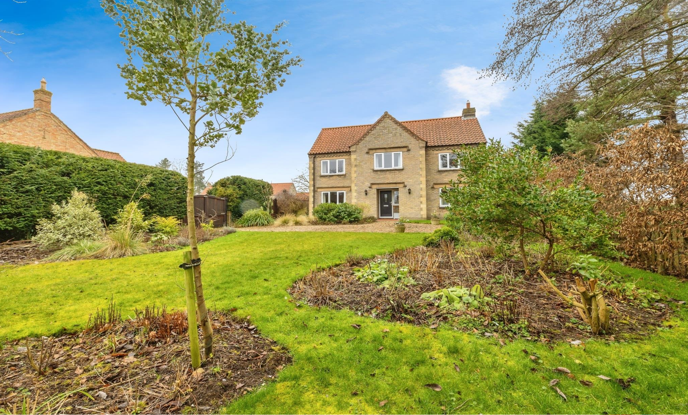
Manor Court, Nocton Lincoln LN4 2BB