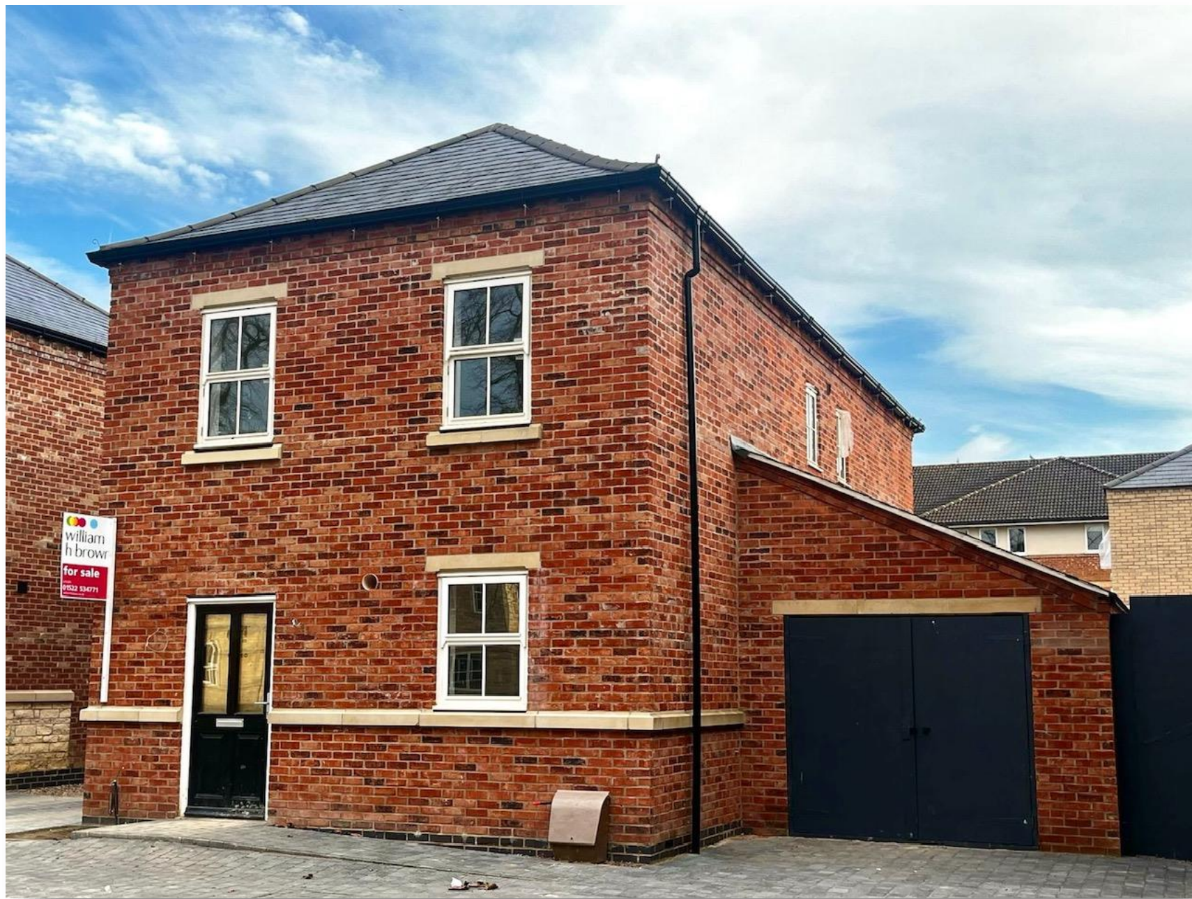
27 Medland Drive, Bracebridge Heath Lincoln LN4 2FS