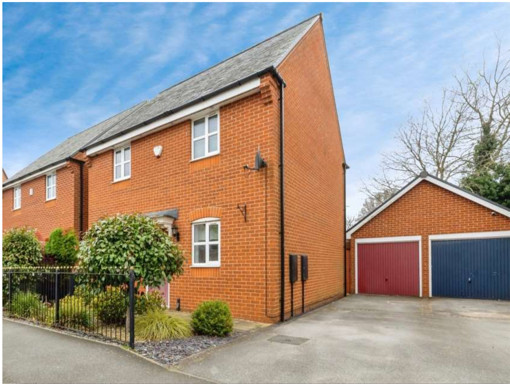
Nero Way, North Hykeham Lincoln LN6 8JP