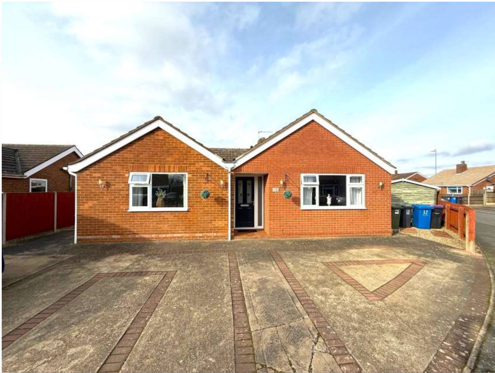
St. Lukes Close, Cherry Willingham Lincoln LN3 4LY