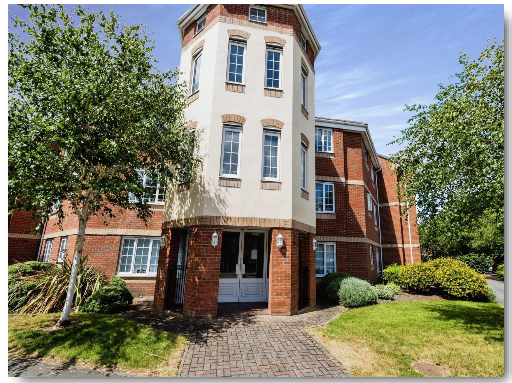
Tiber Road, North Hykeham Lincoln LN6 9TY