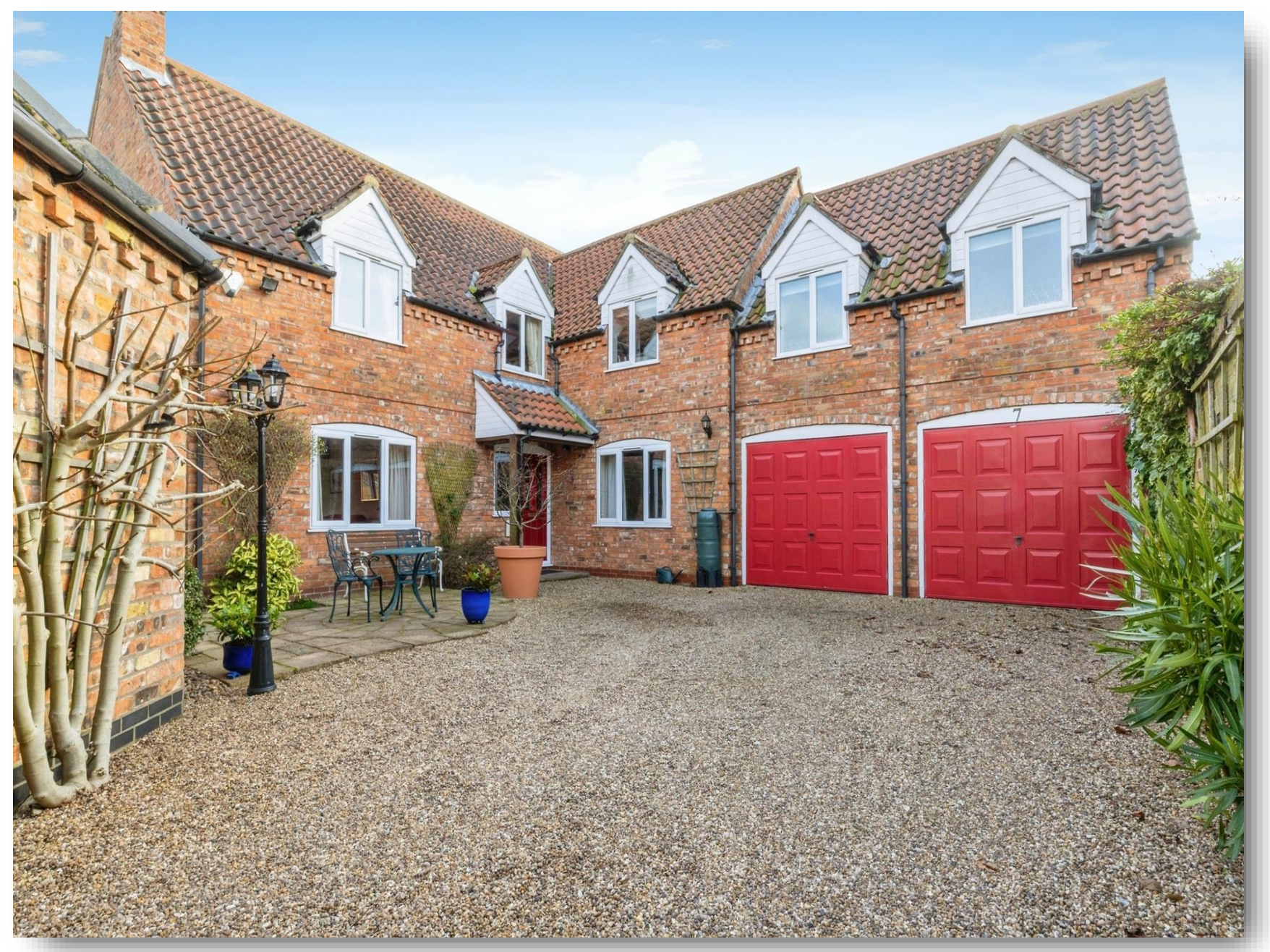
Mill Fields, Bassingham LINCOLN LN5 9NP