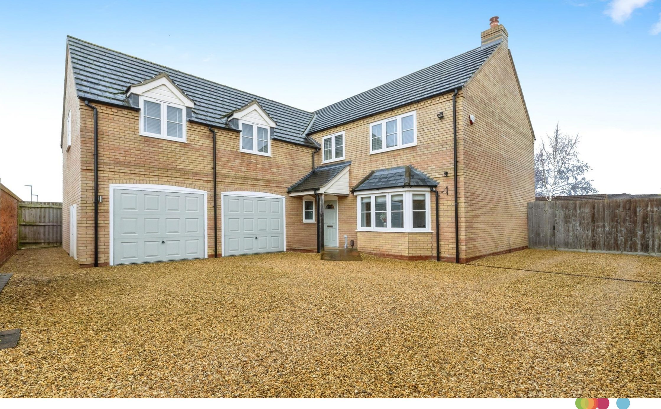
The Sydings, Waddington LINCOLN LN5 9PX