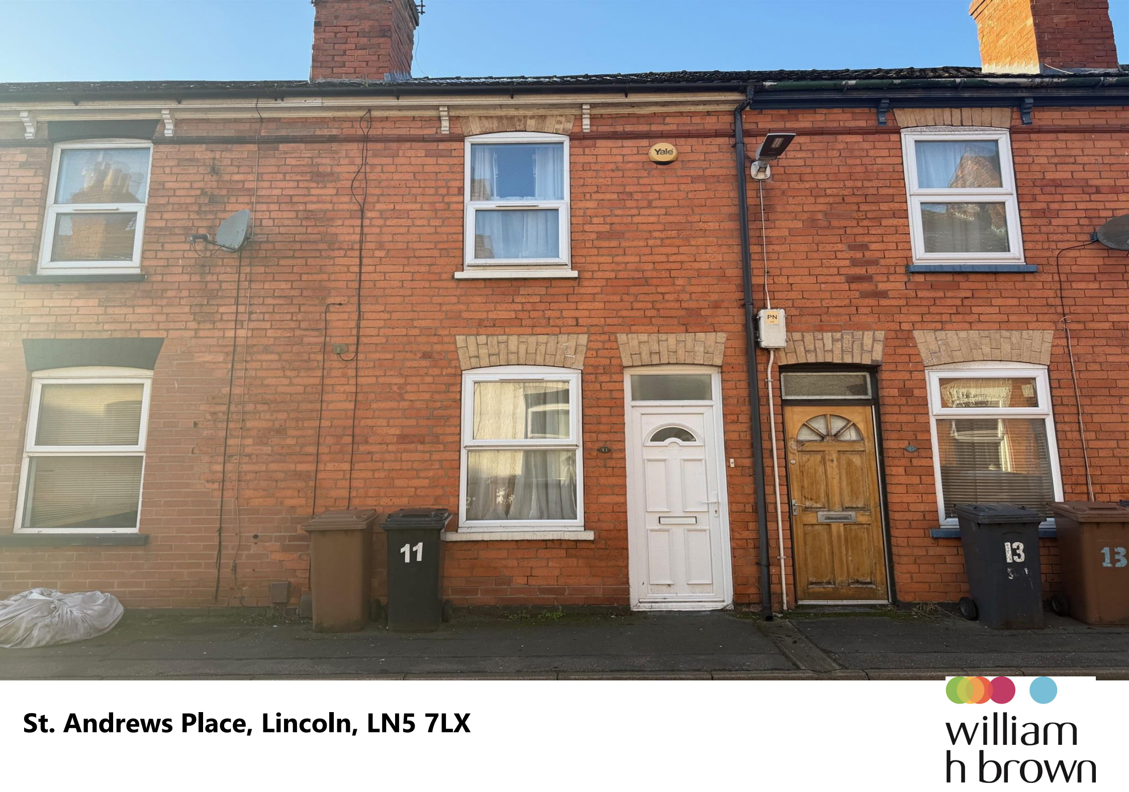
St. Andrews Place, Lincoln, LN5 7LX