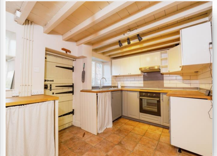
High Street, Leadenham Lincoln LN5 0PP