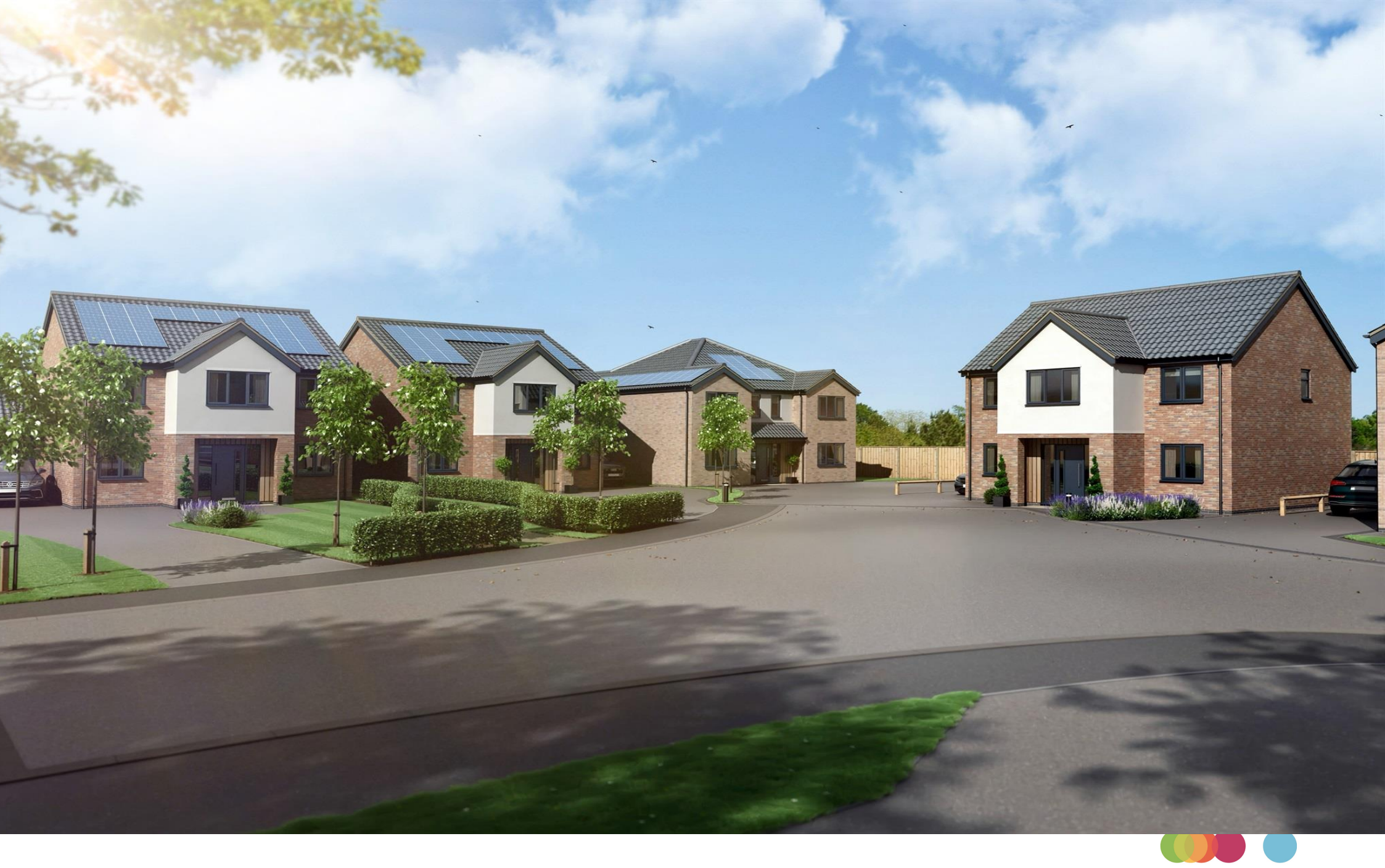
Hope Fields Dunston Road, Metheringham Lincoln LN4 3ED